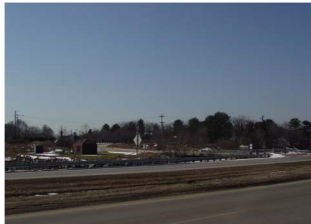
Looking at Albacore Site