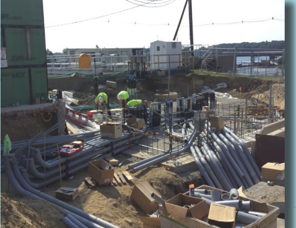
Electrical Facilities New underground electrical conduits being run between the utility transformer and the site of the new Electrical Building.