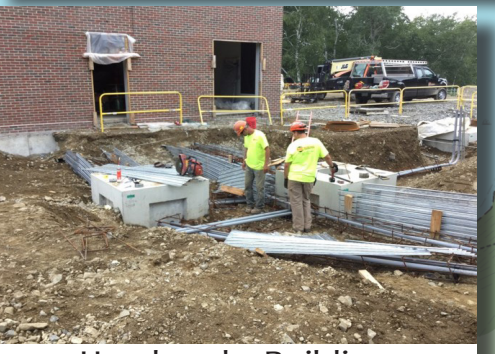
Headworks Building Underground electrical & communication ducts being installed at the Headworks Building.

Aerial view of the BAF, which will provide secondary treatment and nitrogen removal, looking south with Shapleigh Island in the background.