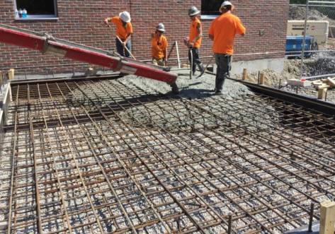
Headworks Building Placing concrete slab for the Odor Control System adjacent to the Headworks Building.

Cell wall reinforcing steel and wall forms are placed with assistance from the 275 ton crane.