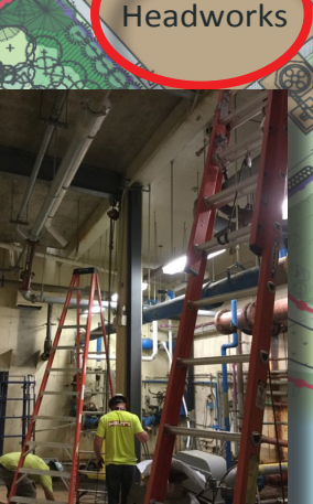
piping being installed.