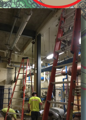
Headworks Building Headworks Building Interior odor control, Flow Control Gates installed heating, and other in the channels in the Headworks Building.