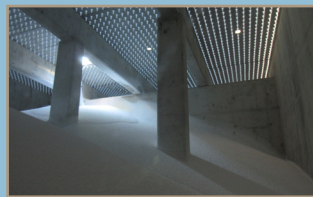
Media Being Loaded Into Cell