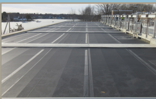
Filter Cell Netting

Representatives from the BAF manufacturer will assist during the start-up period to monitor its operation and confirm that it is working as intended. The BAF is a highly automated treatment system, so a portion of their effort will be spent testing and modifying the automated systems. The BAF manufacturer's staff will also be conducting training for the City's operators on an ongoing basis.