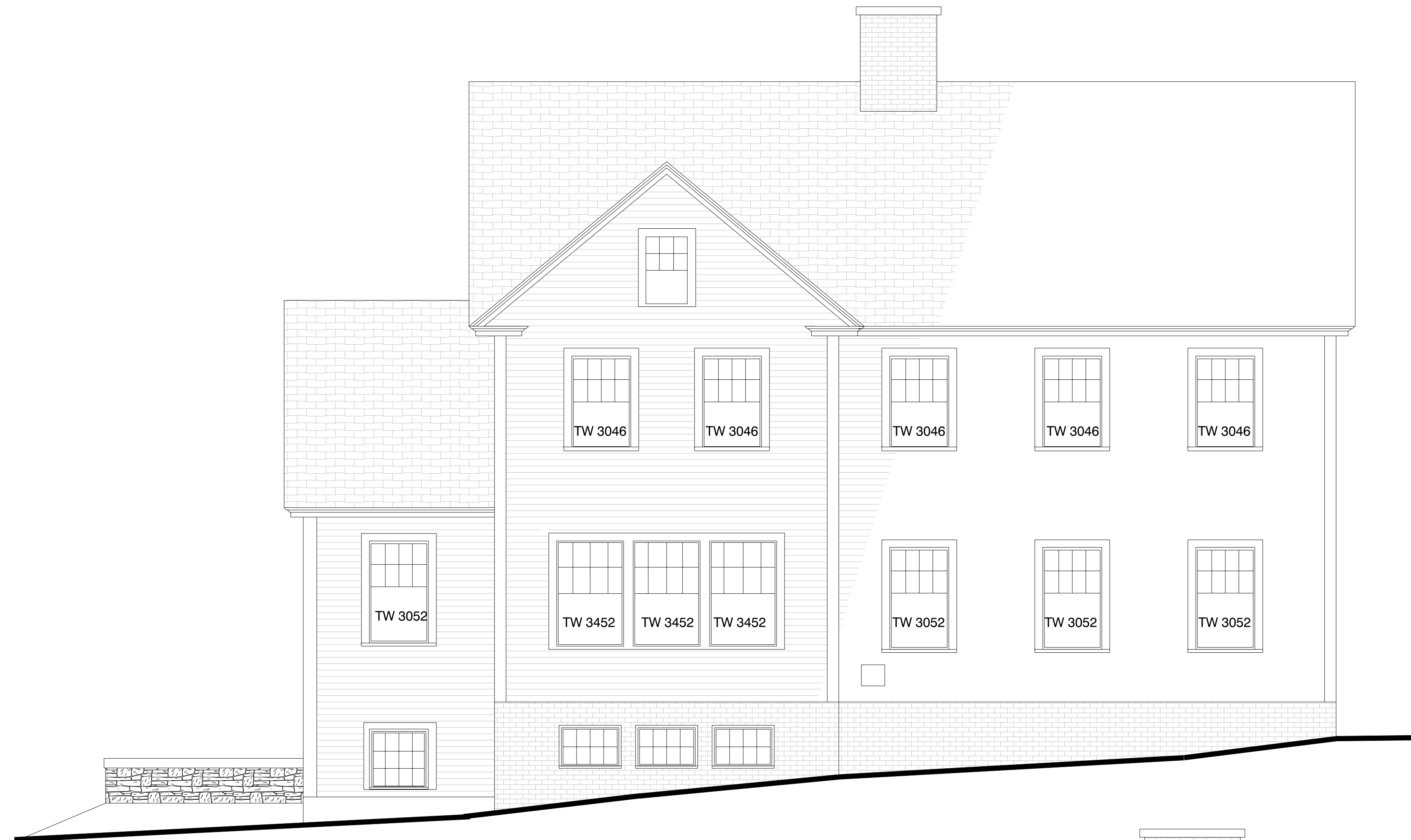
MAPLEWOOD AVE ELEVATION