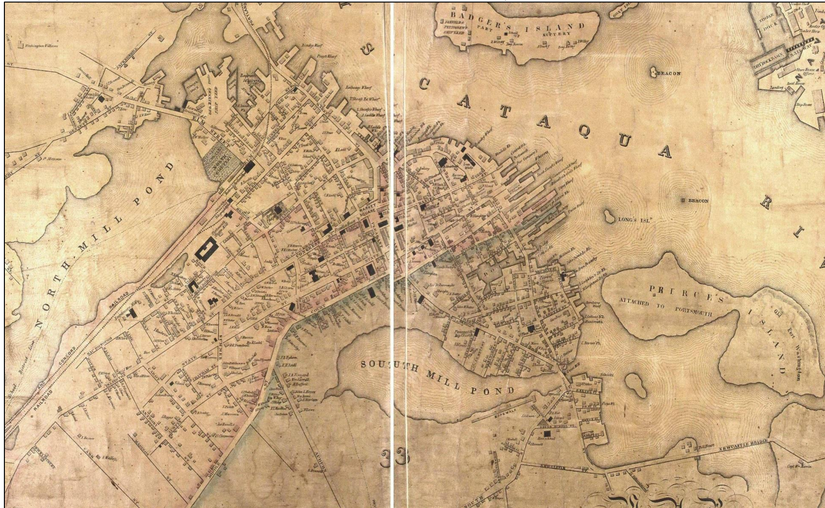
Figure 2. 1850 map of Portsmouth (Walling 1850).