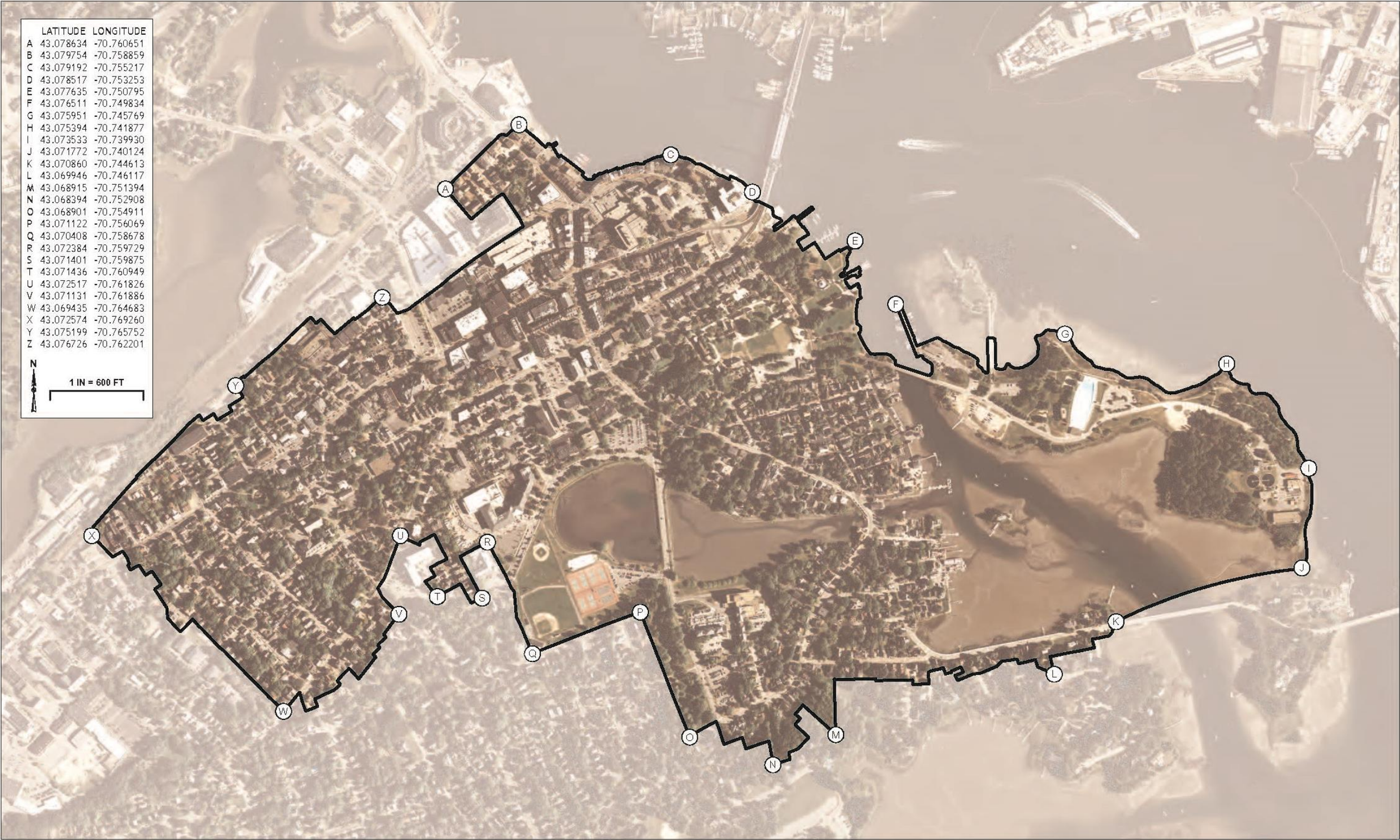
Portsmouth Downtown Historic District National Register Documentation Coordinates Map