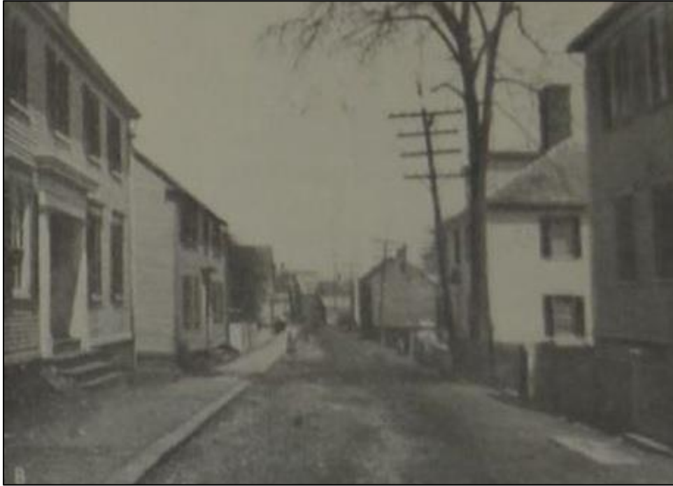
Figure 7. Ca. 1915 photograph of Marcy Street, looking south (Foss 1994:107).