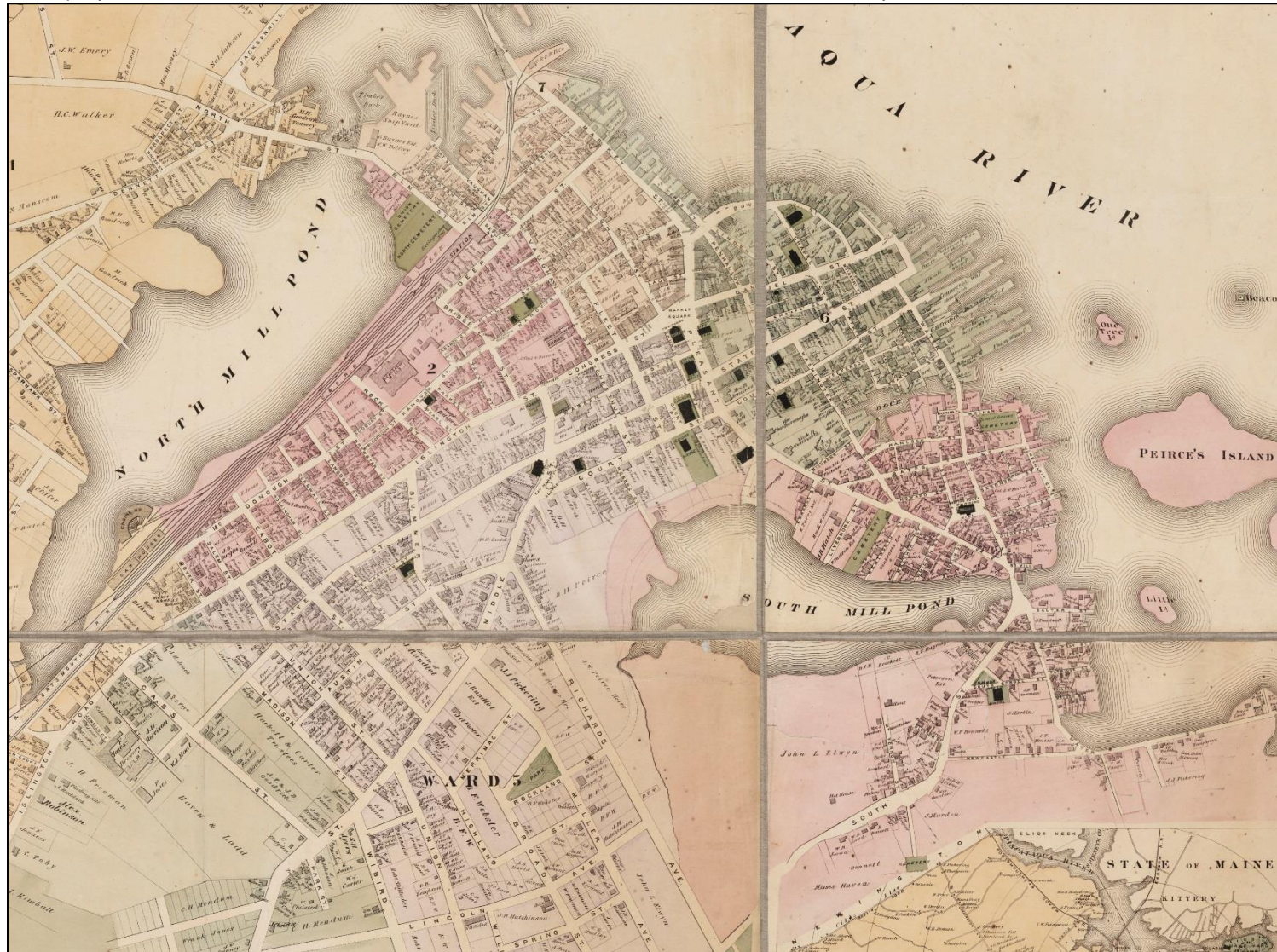
Figure 3. 1876 map of Portsmouth (Beers 1876).