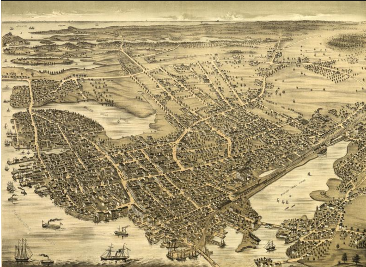
Figure 4. 1877 bird's eye view of Portsmouth (Ruger 1877).