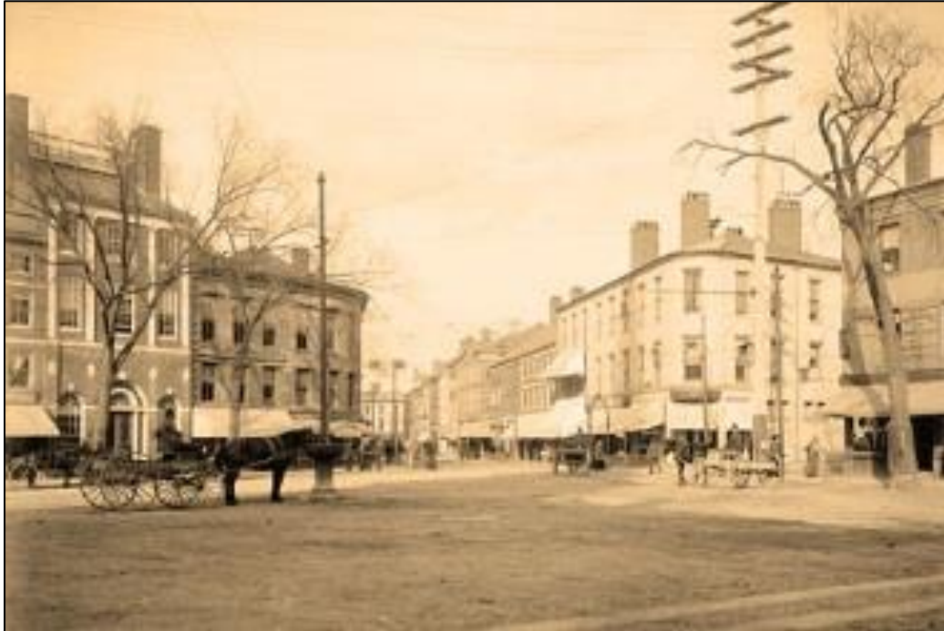
Figure 5. Ca. 1902 photograph of Market Square, looking north.