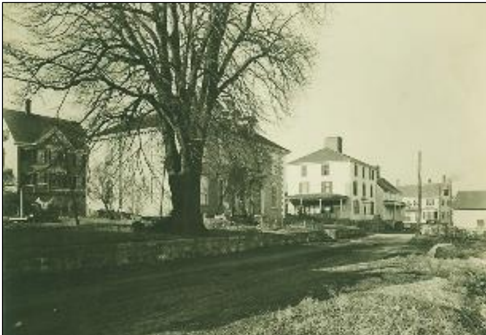
Figure 6. 1915 photograph of Mechanic Street, looking northwest toward the Wentworth-Gardner House (HNE 1915).