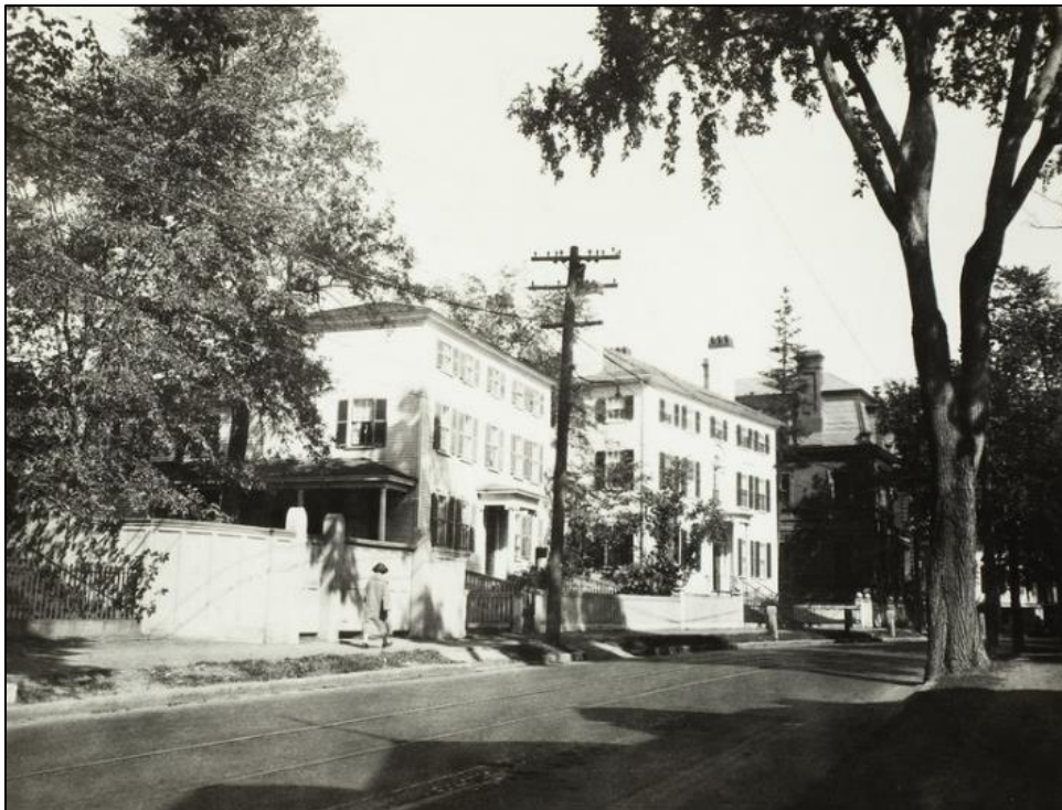
Figure 8. 1924 photograph of the Langley Boardman House (152 Middle St.) and the Samuel Larkin House (160 Middle St.), looking north (HNE 1924).