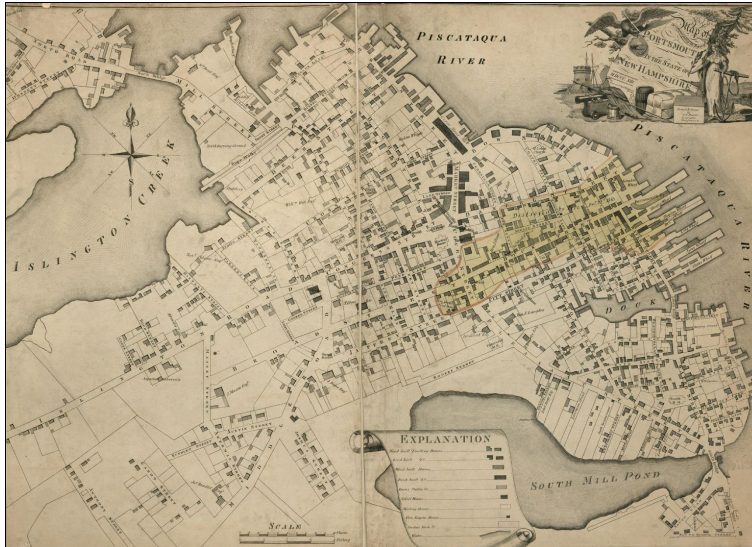
Figure 1. 1813 map of Portsmouth; area highlighted in yellow was destroyed in the Fire of 1813 (Hales 1813).