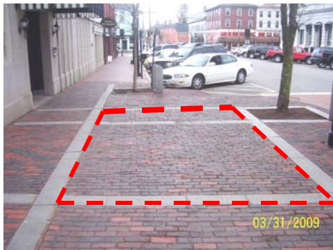
In front of 15 Pleasant Street