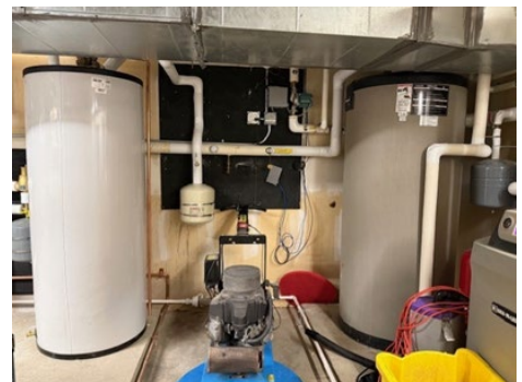
Upgraded hot water heater.