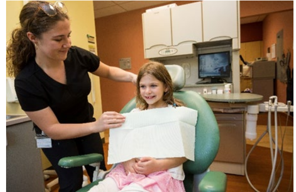
Dental patient at GSCH office in Portsmouth.

GSCH provides medical and dental services to everyone regardless of circumstances or ability to pay.