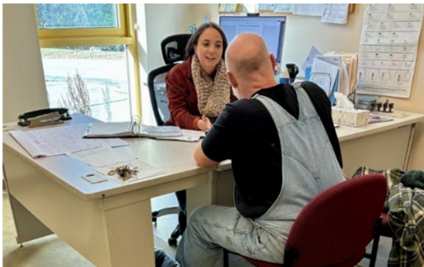
Case Management Services at ARS.