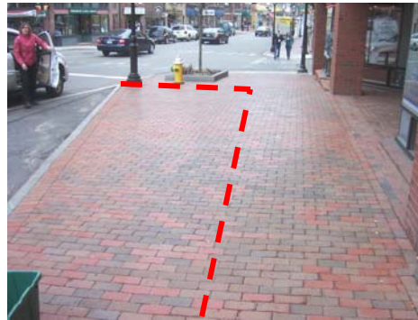
In front of 55 Congress Street