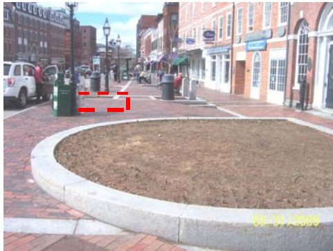
In front of 8 Market Square