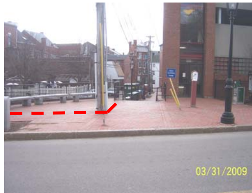
Outside the parking garage on Hanover Street

There are seven locations on public sidewalks in the Downtown Business District that are suitable as vending locations for licensed hawkers and peddlers as identified in this brochure.