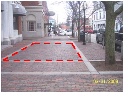
In front of 1 Pleasant Street