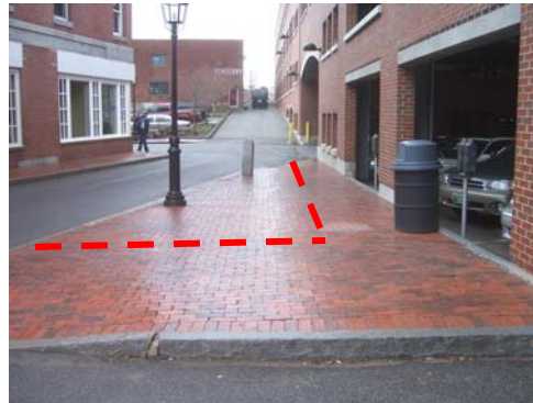
Outside the Ladd Street side of the parking garage