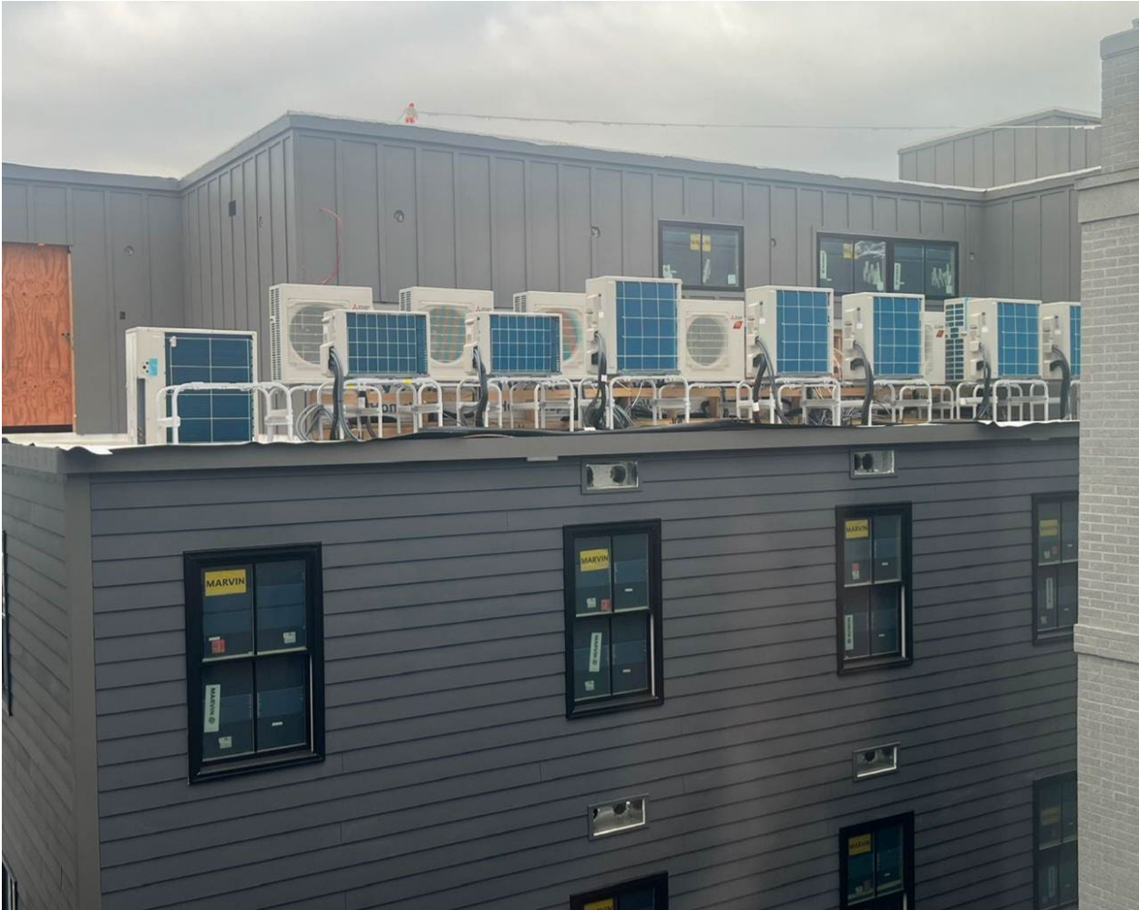
View from Our living room :