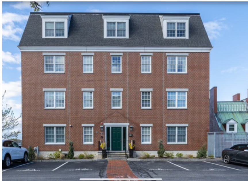
Current state after storm.