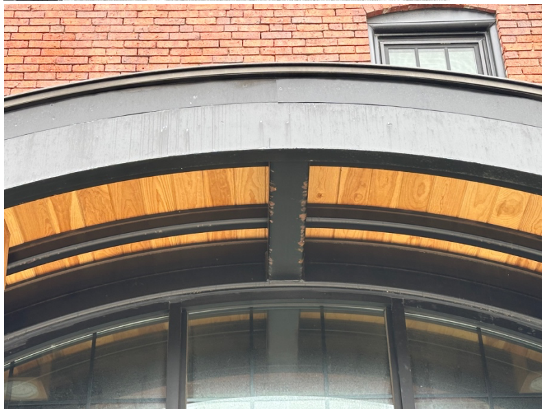
Underside of Proposed Canopy