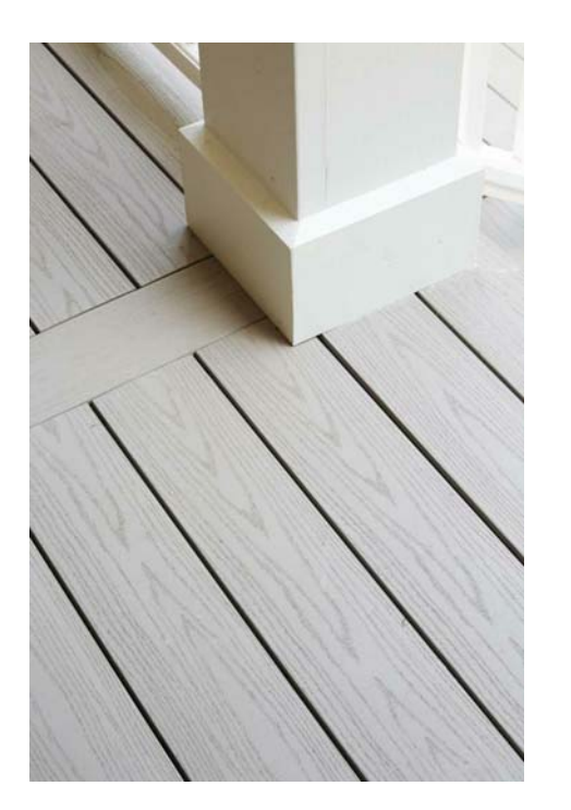
COMPOSITE DECKING: AZEK TIMBERTECH, OR EQUAL