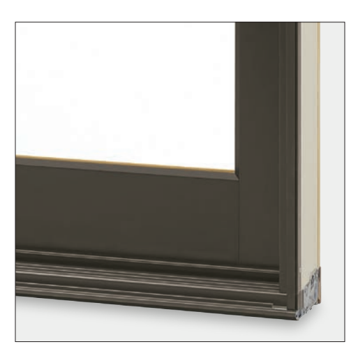
SILL DETAIL SHOWN IN BRONZE