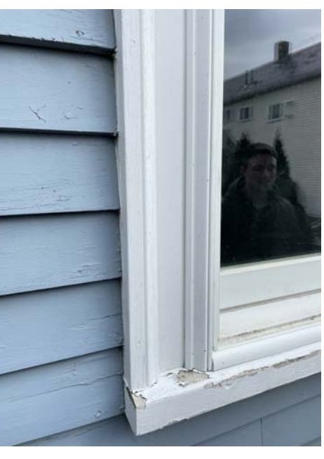
EXISTING WINDOW TRIM- SLIDING DOOR TO MATCH

Historic District Commision Public Hearing - March 2023