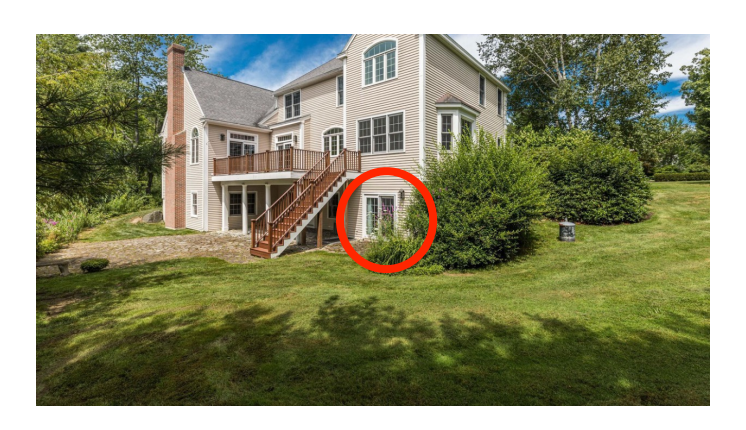
Exhibit #5, Walkout Basement Doorway