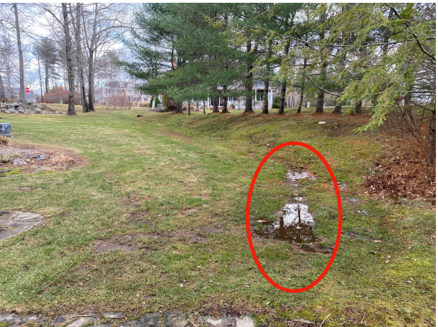
Rainwater Collection Areas