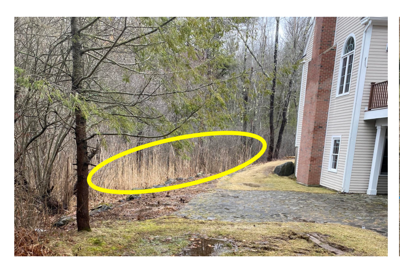
Exhibit #7 Exhibit #8

3. Remove the invasive species of phragmites reeds identified by the yellow ovals in Exhibits #7 and #8 and located on the southwest side of the the residence by hand as suggested by the City of Portsmouth Planning Department. Replace the invasive species of phragmites reeds with winterberry, a species of red colored holly native to eastern North America and suggested by the City of Portsmouth Planning Department.