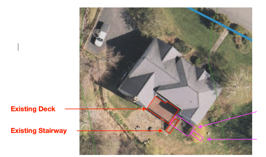
Exhibit #4, Proposed Structure Alterations