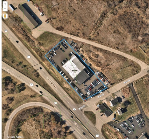
23. 200 Spaulding TPKE 0237-0056-0000 22.23 ac GB and SRB to G1 or G2