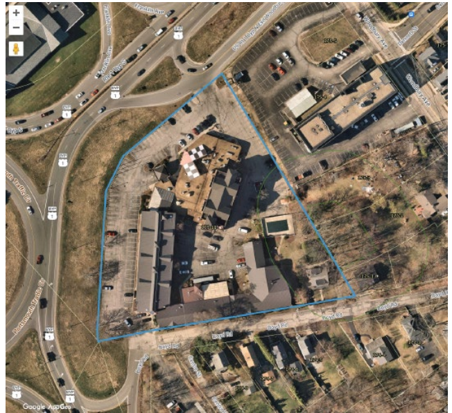
18. 300 Woodbury Ave 0175-0004-0000 1.77 ac GB to G1 or G2 (also 175-5 GB)