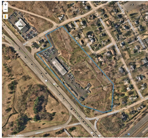
20. 150 Spaulding TPKE 0236-0035-000 .20 GB to G1 or G2