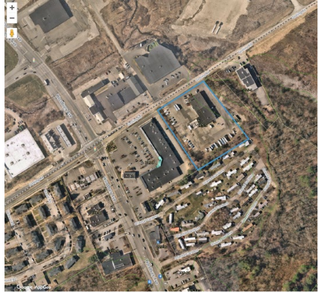
27. 1303 Woodbury Ave 0217-0001-0000 1.51 ac G1 & MRB to G1