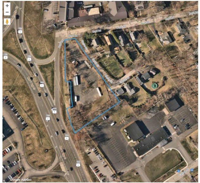
17. 580 US Route 1 BYP 0175-0011-0000 3.68 ac GB to G1 or G2