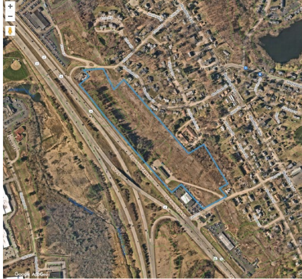
24. 201 Echo Ave 0237-0057-0000 .34 GB to G1 or G2