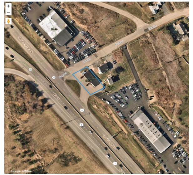
21. 157 Farm Lane 0236-0034-0000 .42 and 0236-0036-0000 .11 GB to G1 or G2