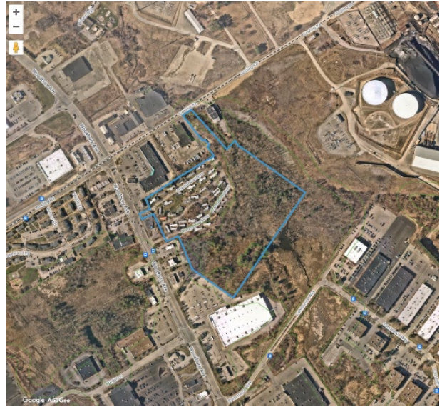
26. 114 Gosling Road 0215-0003-0000 3.00 OR to G1