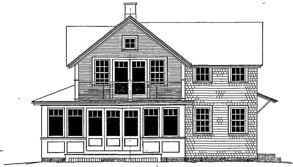
PROPOSED EAST (RIVER SIDE) ELEVATION 1/4"=1'0"