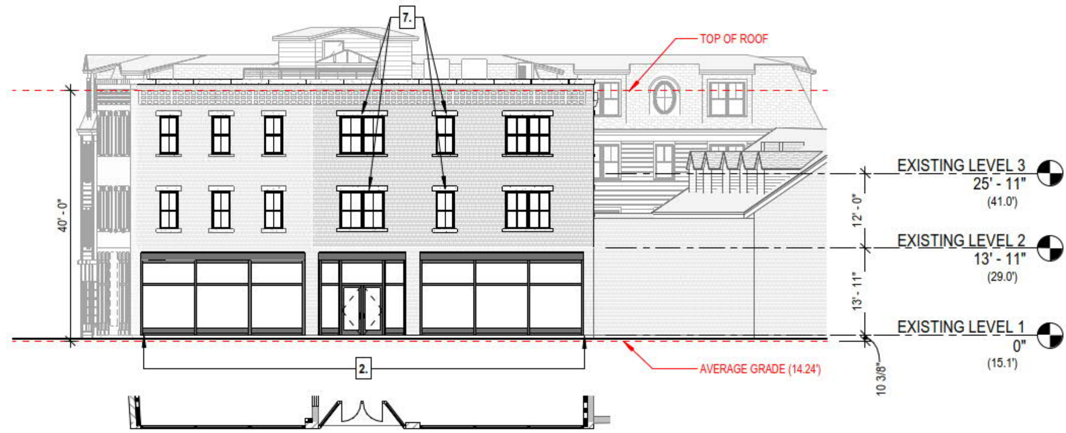
2 EAST ELEVATION - HDC - PREVIOUSLY SUBMITTED ON 11/19/2021 1/16" = 1'-0"