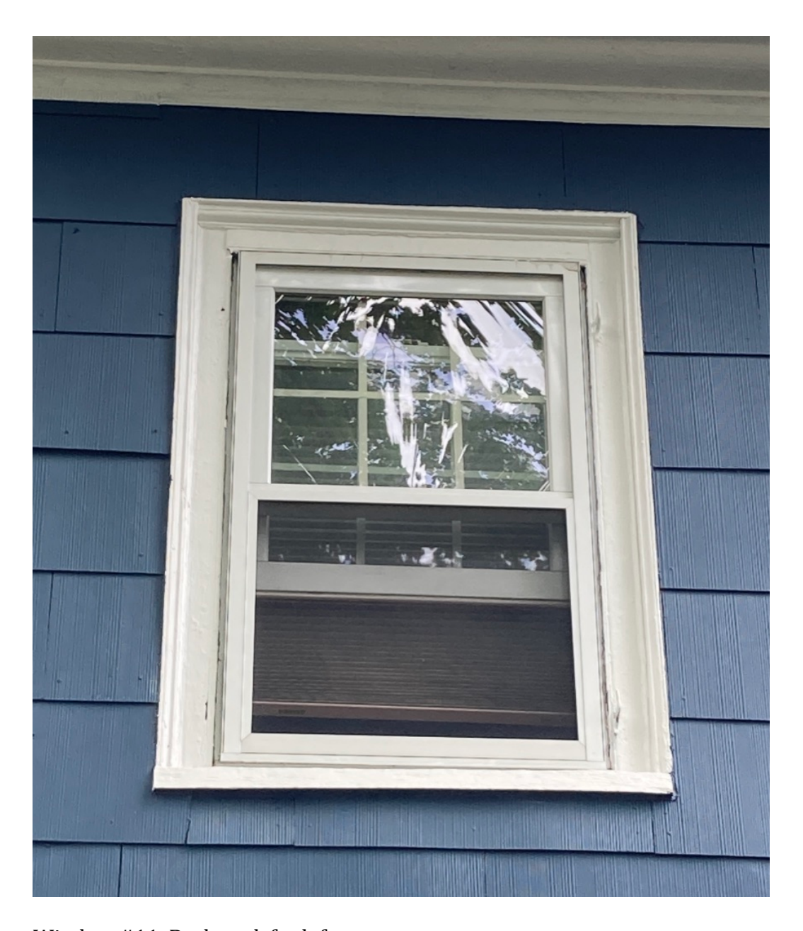
Window #11, Backyard, far left