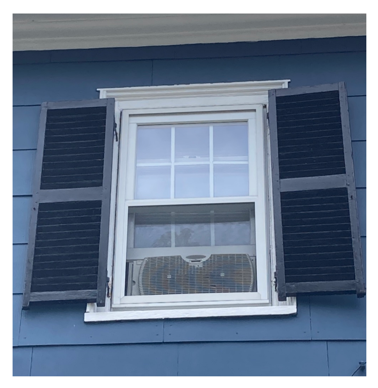
Window #6, Chauncey Street Side, 1st window from Wibird Street