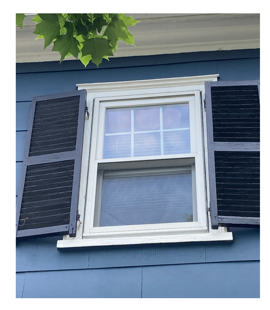
Window #5, Wibird Street, far left