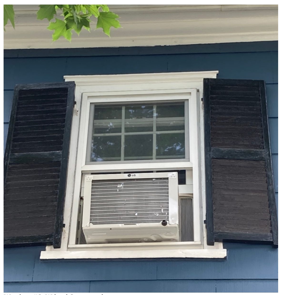
Window #2, Wibird Street, right