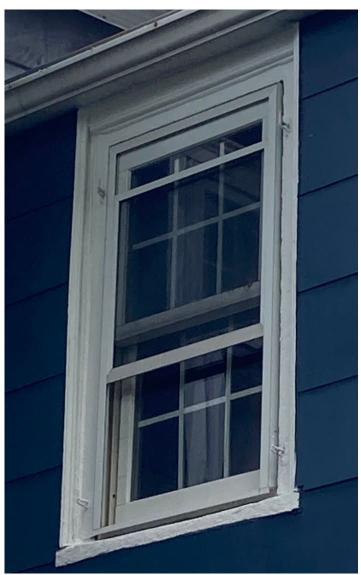
Window #9, Backyard, window looking out on flat roof