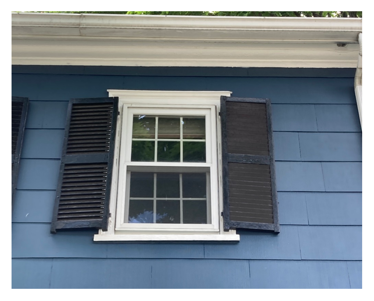
Window #1, Wibird Street, far right