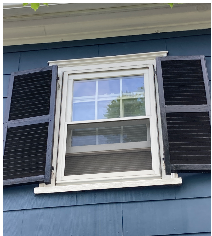
Window #4, Wibird Street, left