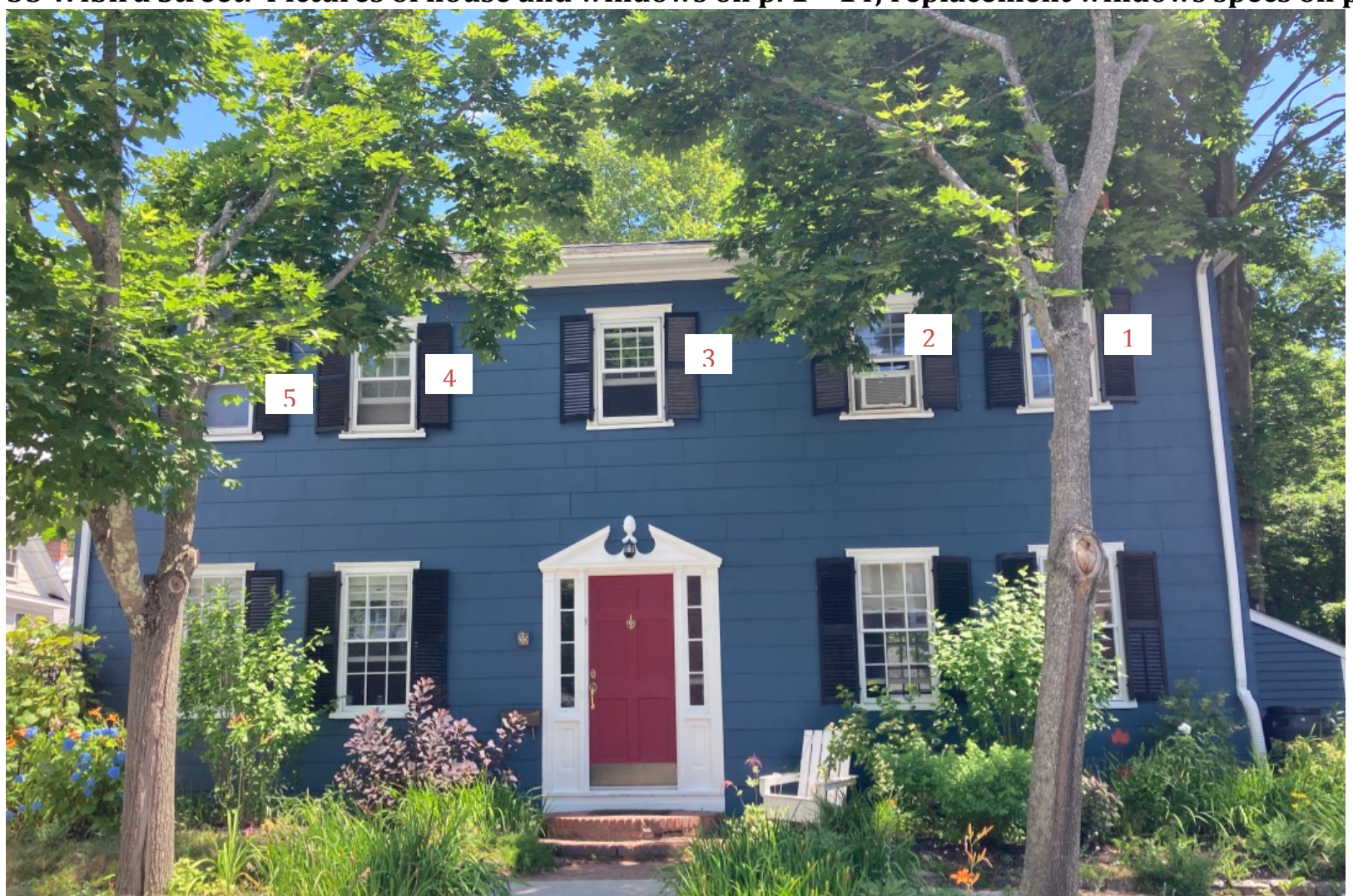
35 Wibird Street Front of House on Wibird Street Windows #1 – 5 (See pages 4 -8 for detailed picture)