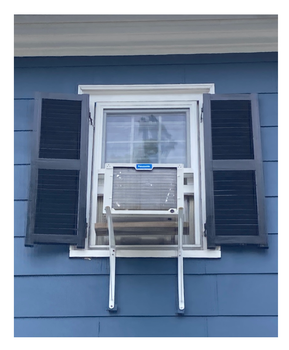
Window #7 Chauncey Street Side, 2^{nd} window from Wibird Street