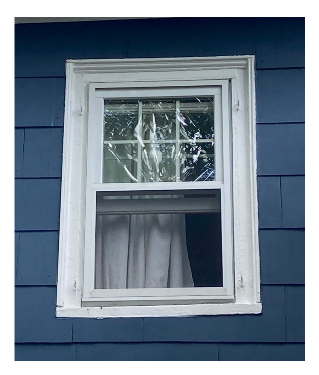
Window #10, Backyard, center