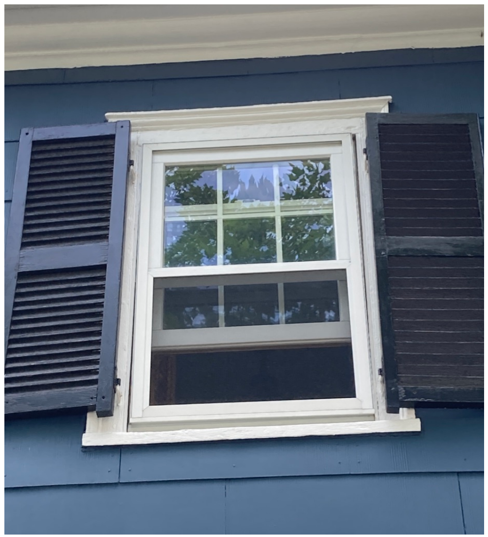
Window #3, Wibird Street, center