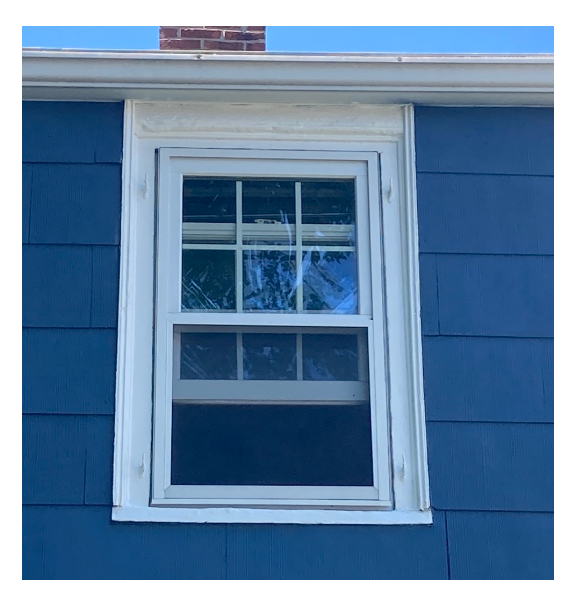
Window #8, Backyard,, closest to Chauncey Street