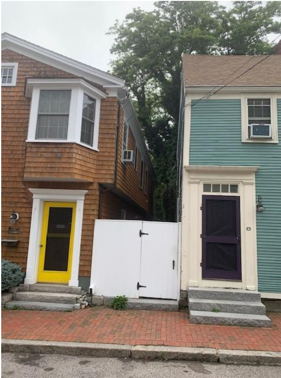
Existing Cedar shingles- proposed to switch to cedar clapboards.