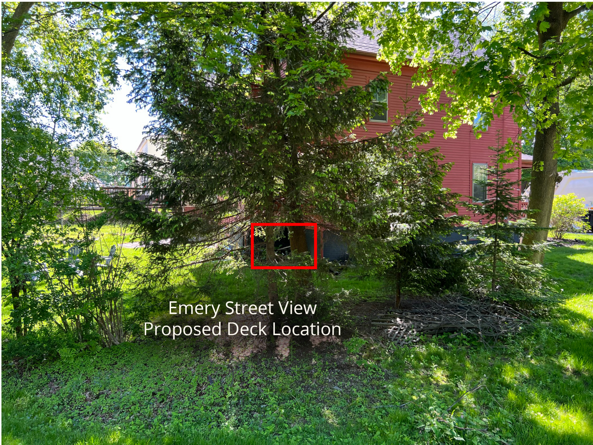
Emery Street View Proposed Deck Location