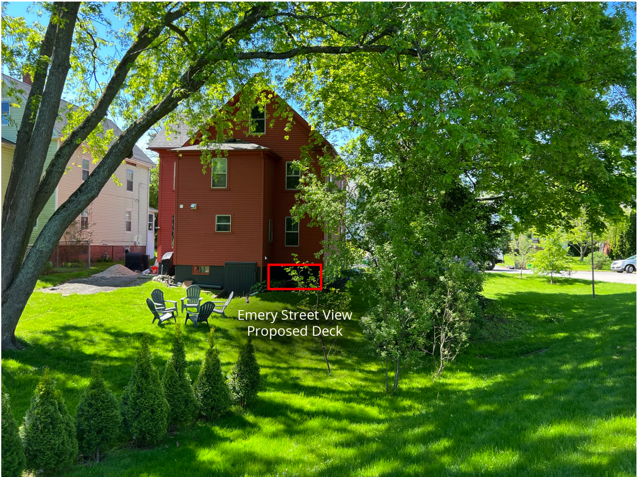
Emery Street View Proposed Deck