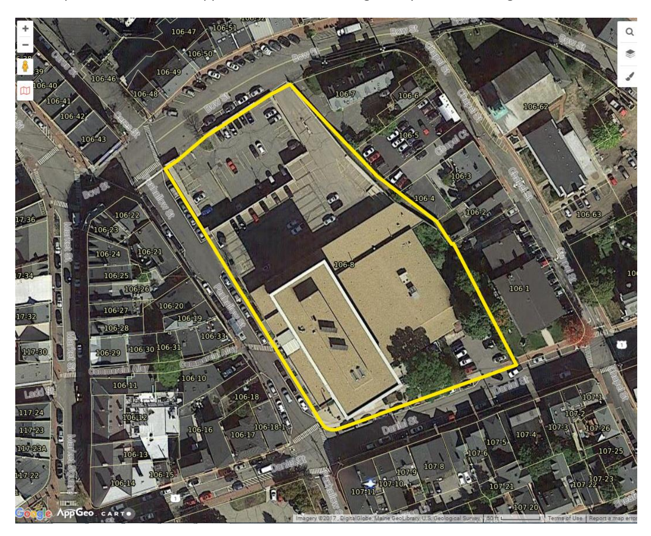
Existing Conditions – Federal McIntyre Property, 80 Daniel Street, Portsmouth, NH (Map 106, Lot 8)

The development entity will be required to develop and prepare all necessary local, state, and federal permit and land use applications and attend regulatory board meetings as needed.