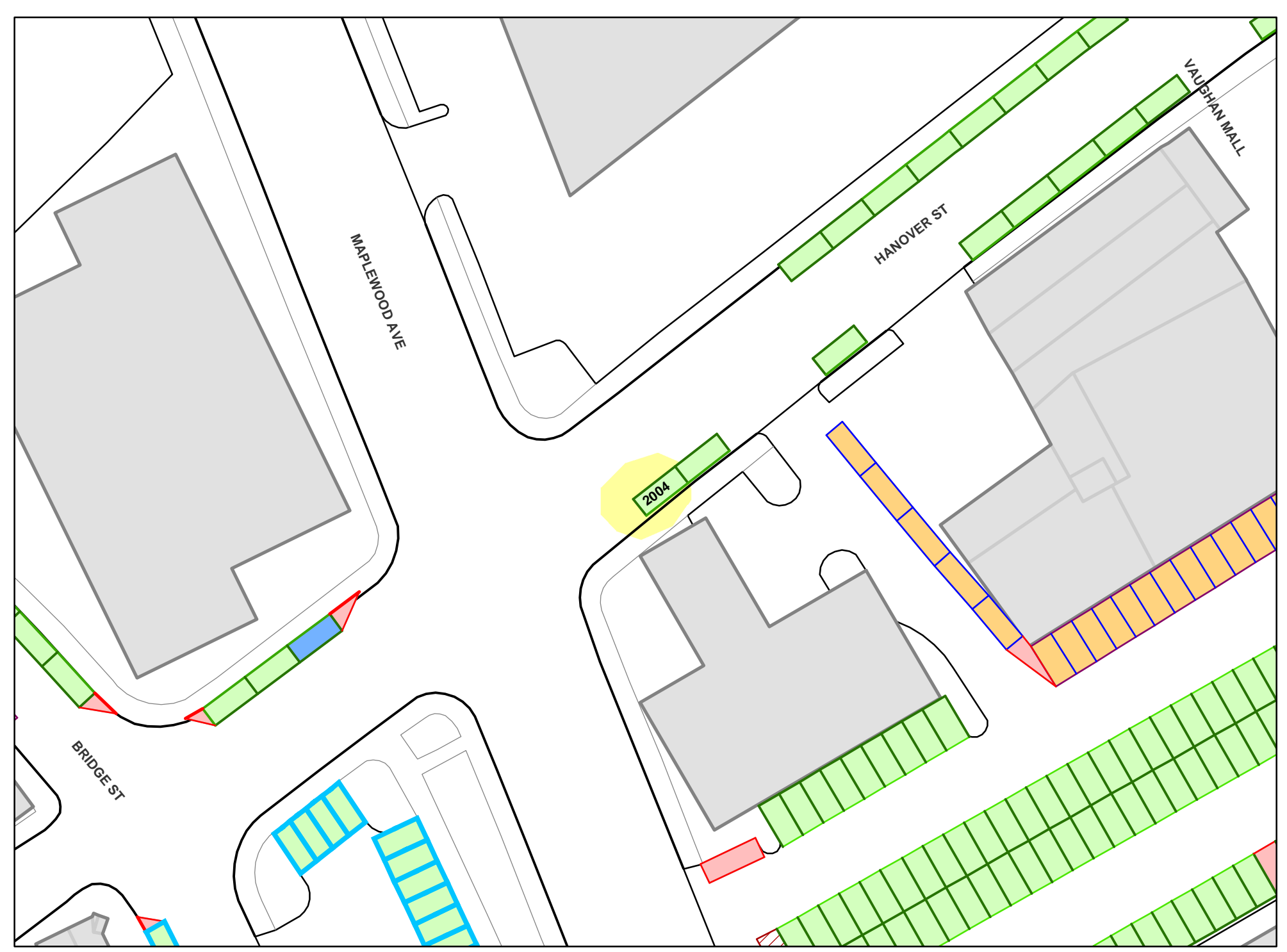
Hanover Street - Vending Space #2004