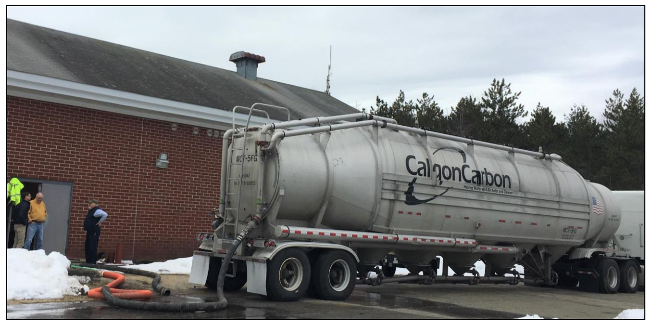
March 28, 2018 – New Carbon for Pease Demonstration Filter No. 2

In order to continue the demonstration project and to also assure treatment of the PFAS compounds, the City proposed changing out Filter Number 2 with new carbon. The Air Force did not agree to pay for covering the cost of the replacement of carbon but did not object to the City proceeding with this on our own. Therefore, we proceeded to order the new carbon and it was installed during the week of March 26, 2018. We will continue our discussions with the Air Force about potential reimbursement of the cost of this work.