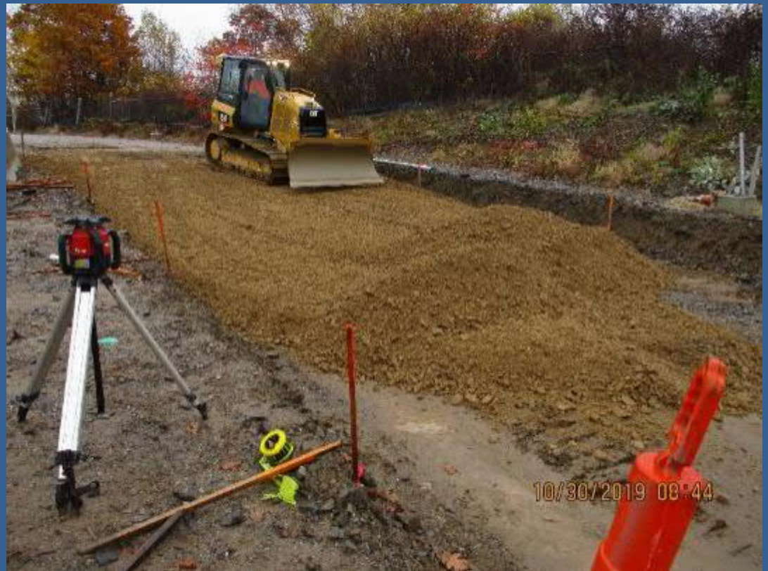
Yard Piping & Utilities