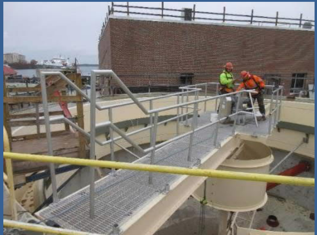
Gravity Thickener No. 2