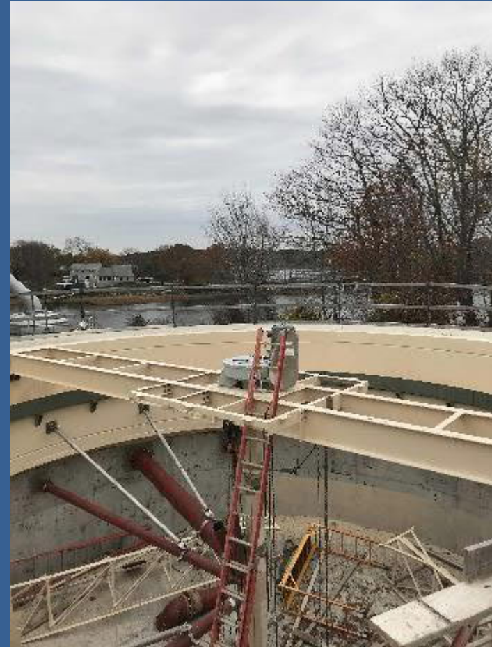
Gravity Thickener No. 2