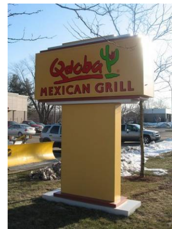
Width of support is greater than 1/3 of the width of the sign – Included in sign area