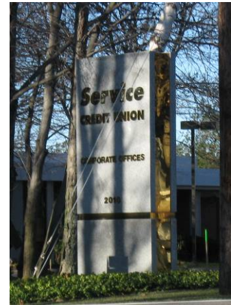
Height of base is greater than one foot – Included in sign area

10.1252.22 The vertical supports of a pole sign shall not be included in the computation of sign area , provided that (1) the total width of all such supports is less than one-third of the width of the sign , and (2) the supports are not illuminated in any way.