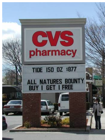
Total width of supports is greater than 1/3 of the width of the sign – Included in sign area