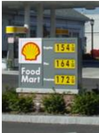
Height of base is less than one foot – Not included in sign area

10.1252.21 The base of a monument sign , up to one foot above the ground, shall not be included in the computation of sign area provided that such base is not illuminated in any way and contains no information other than the street number.