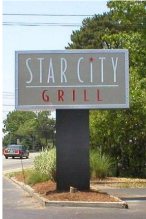
Width of support is approximately 1/3 of the width of the sign