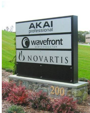
Height of base is one foot – Not included in sign area