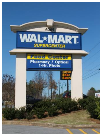
Total width of supports is less than 1/3 of the width of the sign – Not included in sign area

10.1252.22 The vertical supports of a pole sign shall not be included in the computation of sign area , provided that (1) the total width of all such supports is less than one-third of the width of the sign , and (2) the supports are not illuminated in any way.