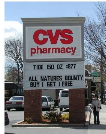
Total width of supports is greater than 1/3 of the width of the sign – Included in sign area