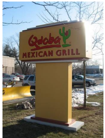
Width of support is greater than 1/3 of the width of the sign – Included in sign area