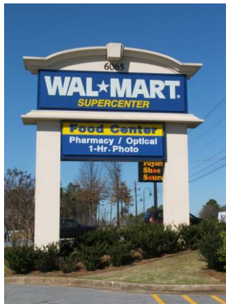
Total width of supports is less than 1/3 of the width of the sign – Not included in sign area

10.1252.22 The vertical supports of a pole sign shall not be included in the computation of sign area , provided that (1) the total width of all such supports is less than one-third of the width of the sign , and (2) the supports are not illuminated in any way.