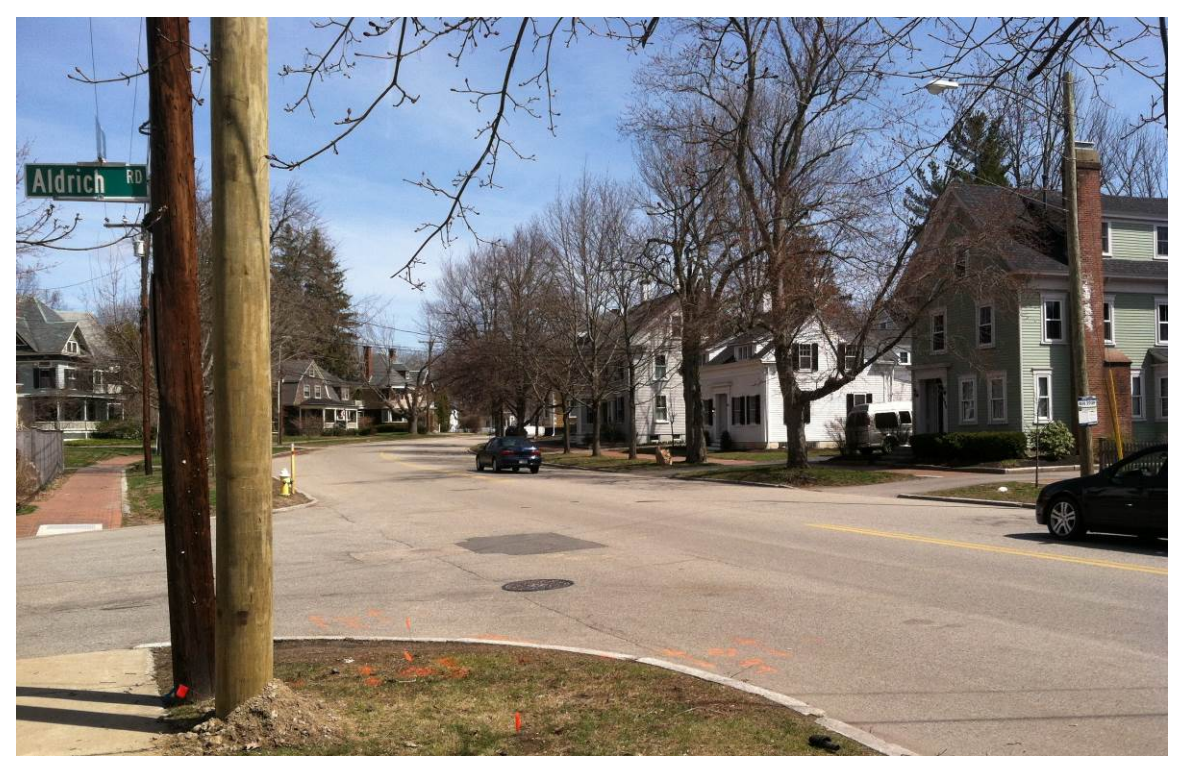
Middle Street at Aldrich Road