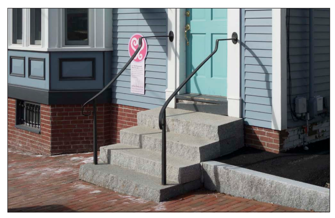
A simple, unobtrusive, metal rail was added to the granite steps to provide secure access to the door.

A balustrade is a railing with upper and lower horizontal members, known as rails, and vertical balusters of wood or metal. A replacement balustrade should match the overall style and character of the building.