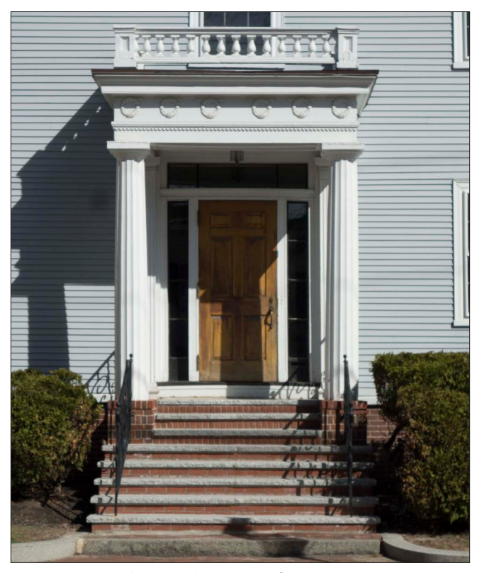
An entrance porch can evoke a sense of grandeur and provide a welcoming feature for visitors.

These Guidelines were developed in conjunction with the City of Portsmouth's Historic District Commission (HDC) and the Planning Department. Please review this information during the early stages of planning a project. Familiarity with this material can assist in moving a project quickly through the approval process, saving applicants both time and money.