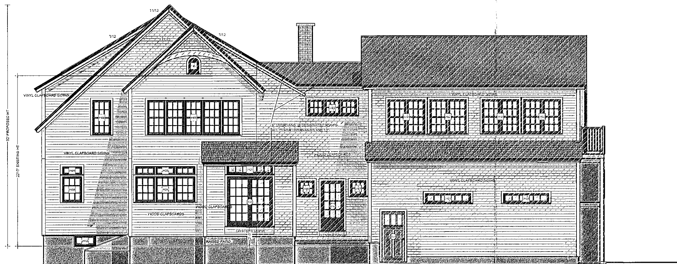
EXTERIOR ELEVATION BACK