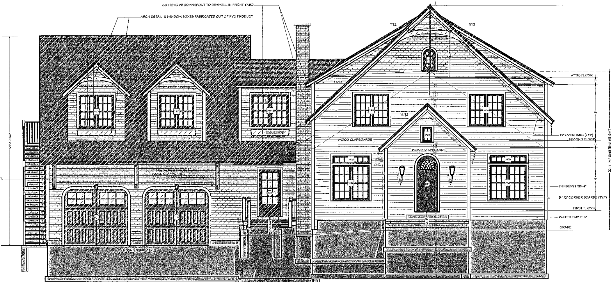
EXTERIOR ELEVATION FRONT