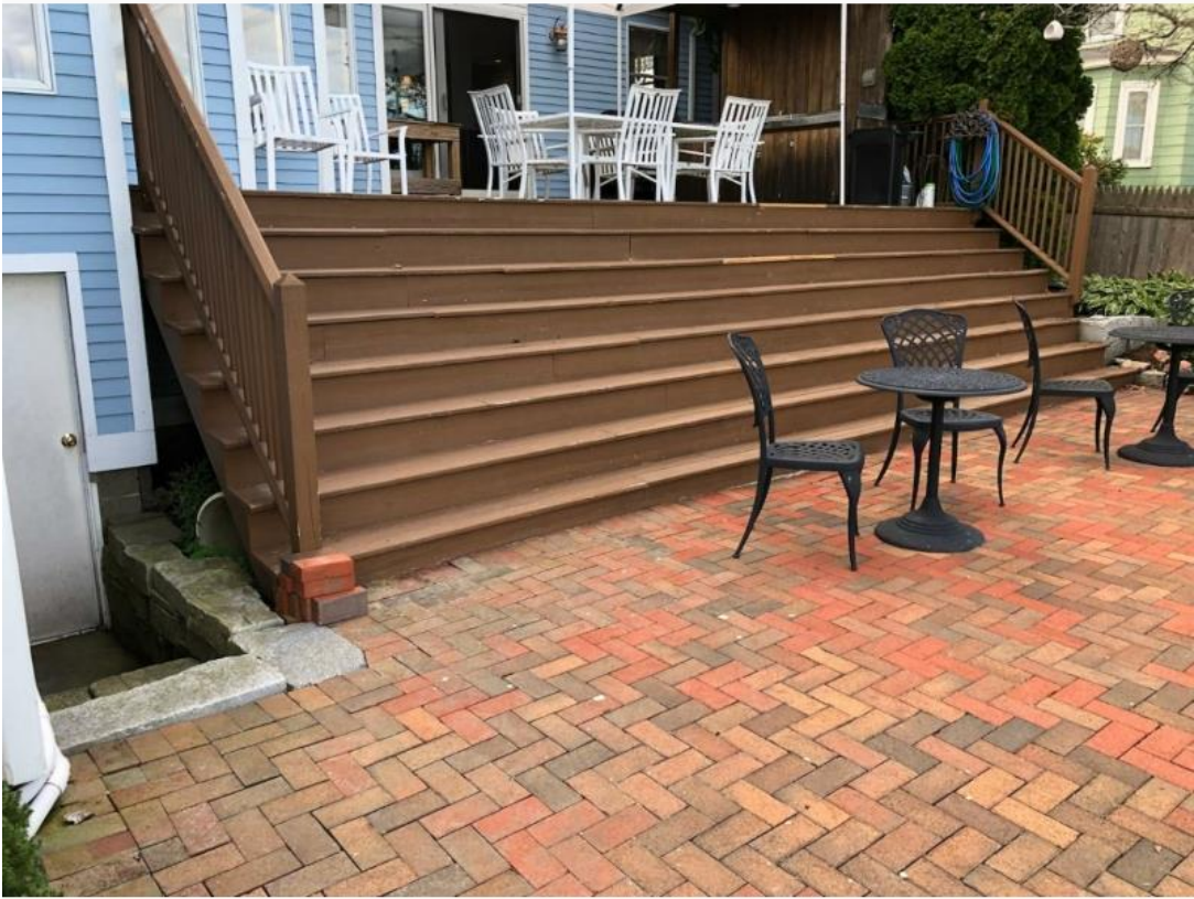
Old deck in rear facing water