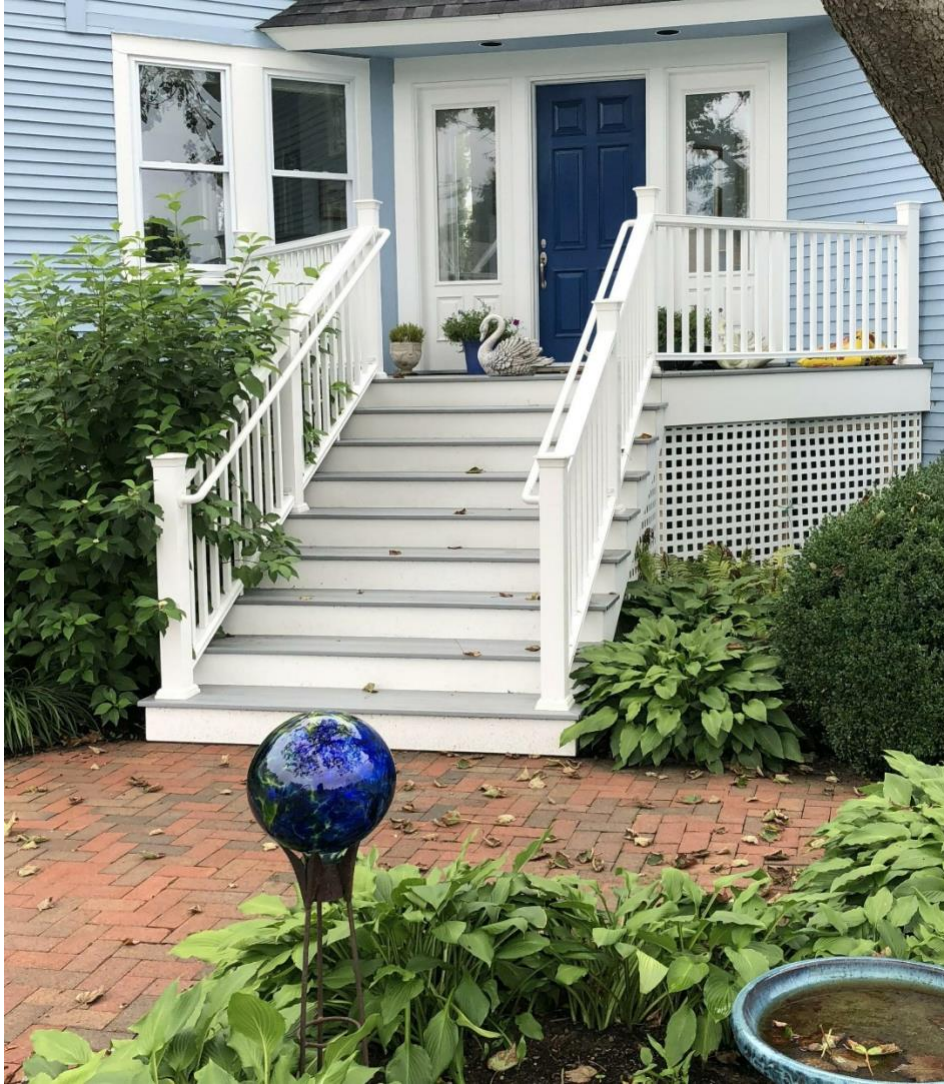
main front entry deck