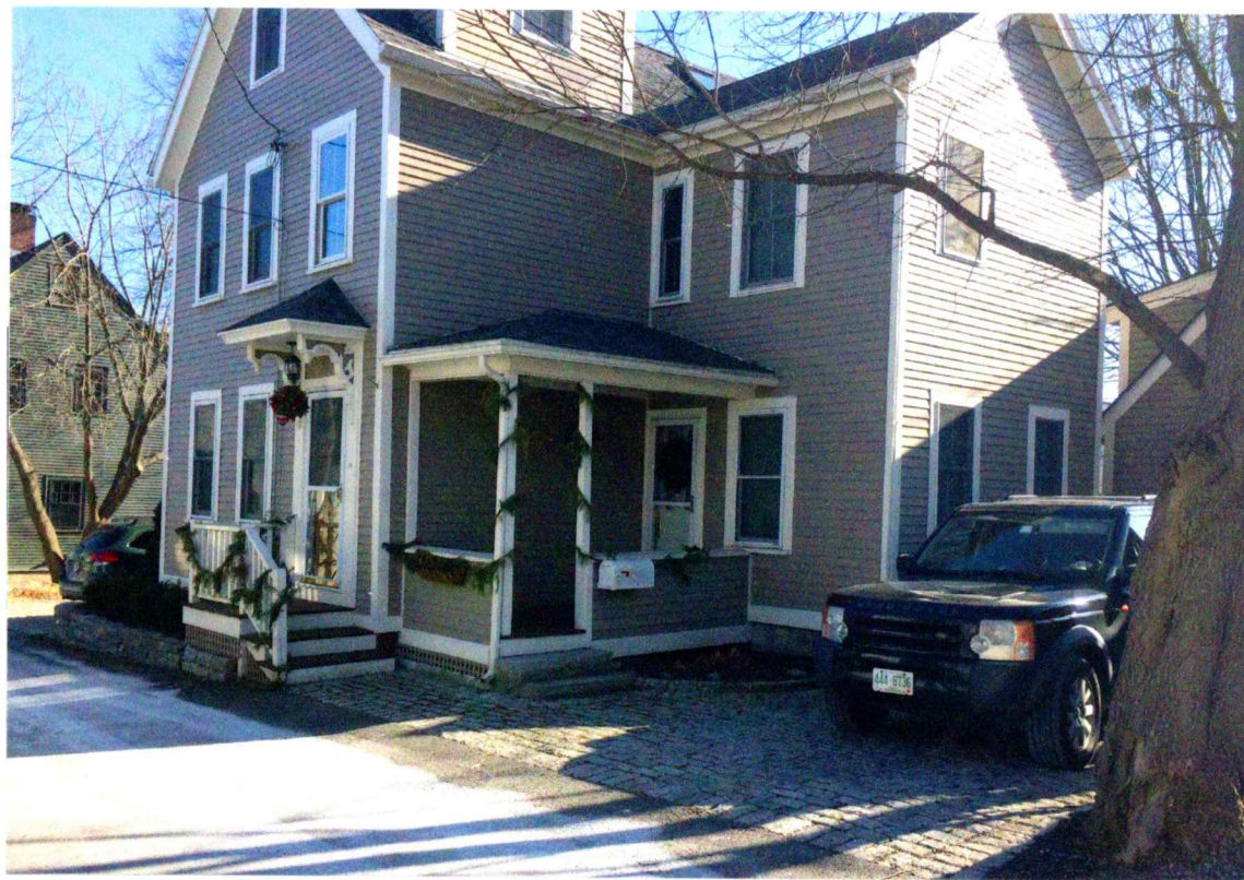
EXISTING FRONT & RIGHT SIDE