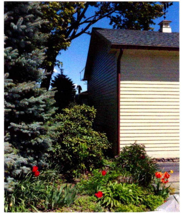
VIEW FROM NEW CASTLE AVE