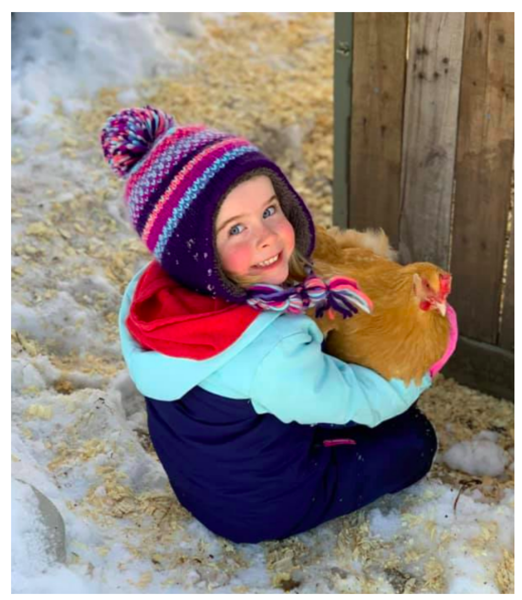
Peep, the buff orpington hen, and our daughter.