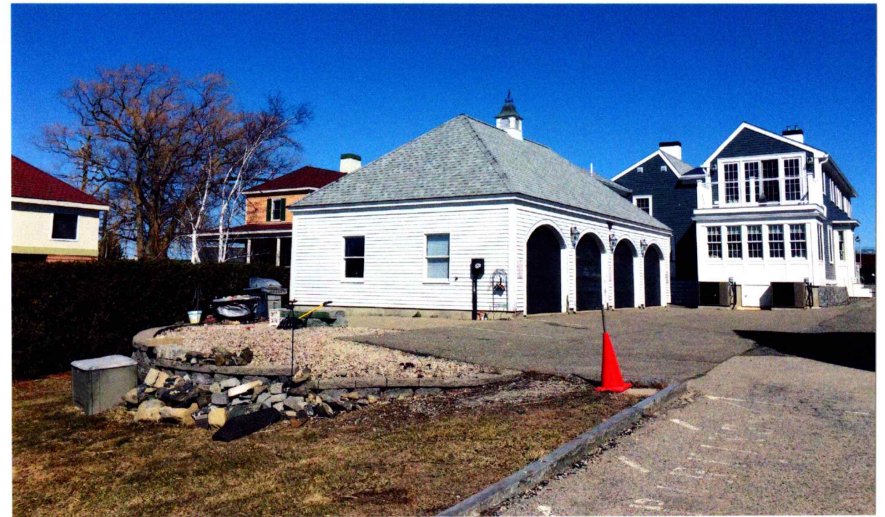
IEWS FROM WEST YARD