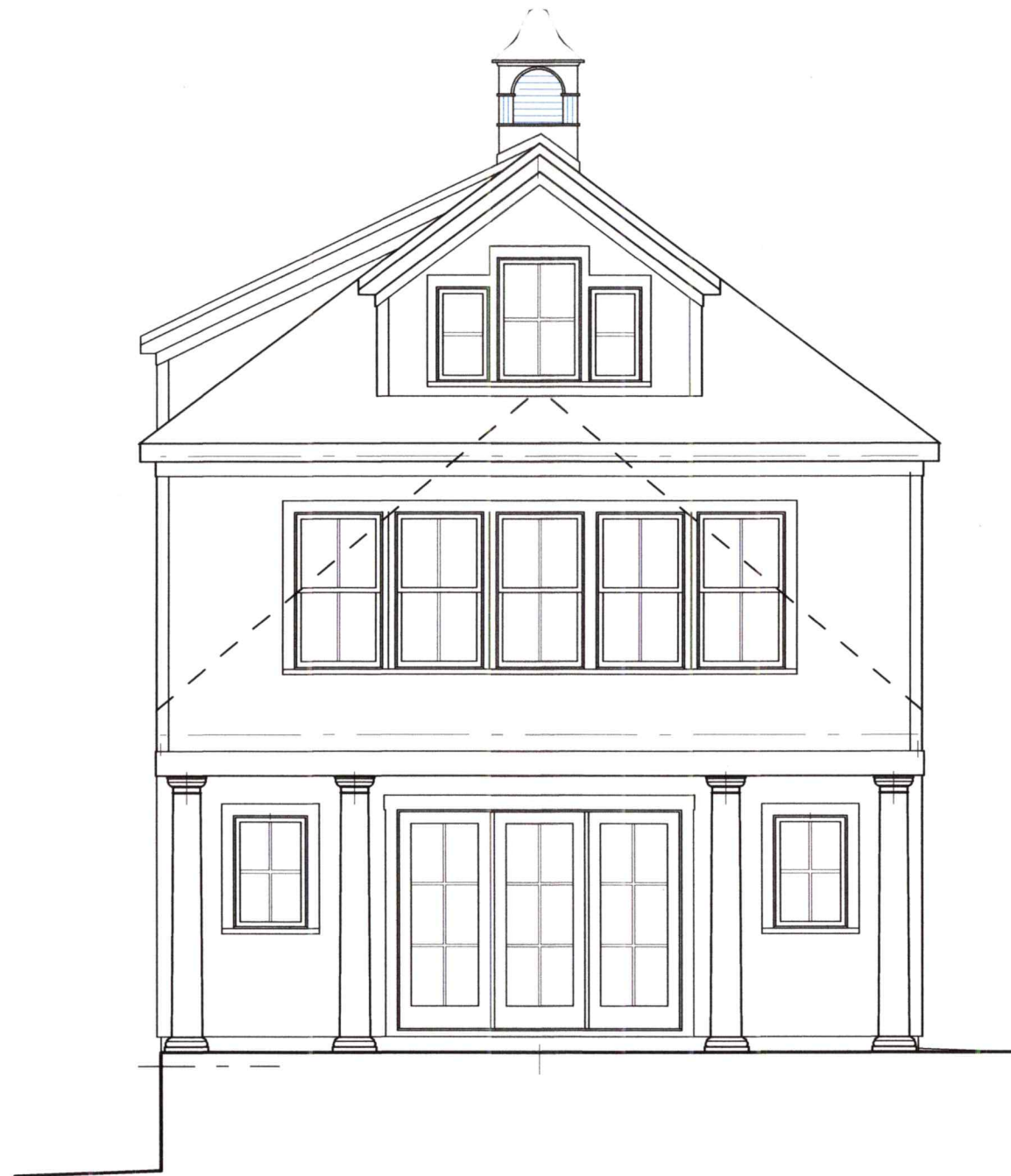
WEST ELEVATION SCALE: 3/16" = 1'-0"