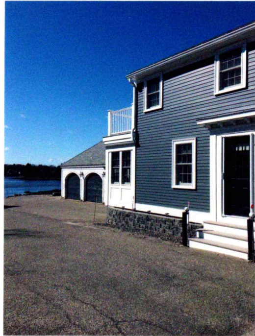
VIEW FROM DRIVEWAY ENTRY