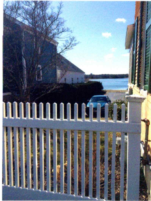
VIEW FROM MAPLEWOOD AVE SIDEWALK