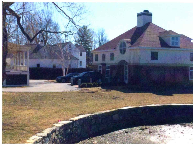
VIEW FROM NORTH MILL POND BRIDGE