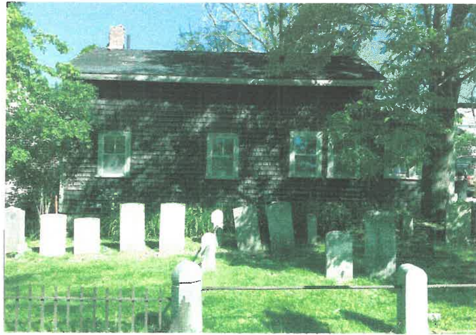
EXISTING LEFT SIDE