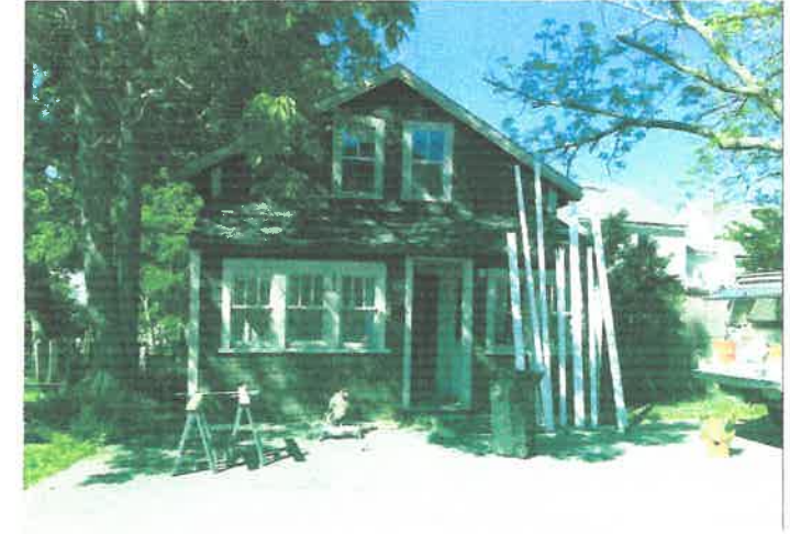
EXISTING FRONT VIEWS