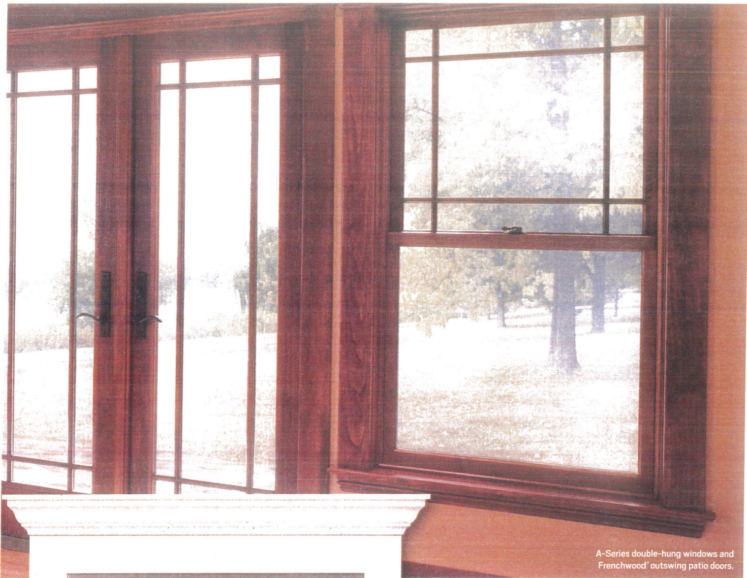
A-Series double-hung windows and Frenchwood® outswing patio doors.