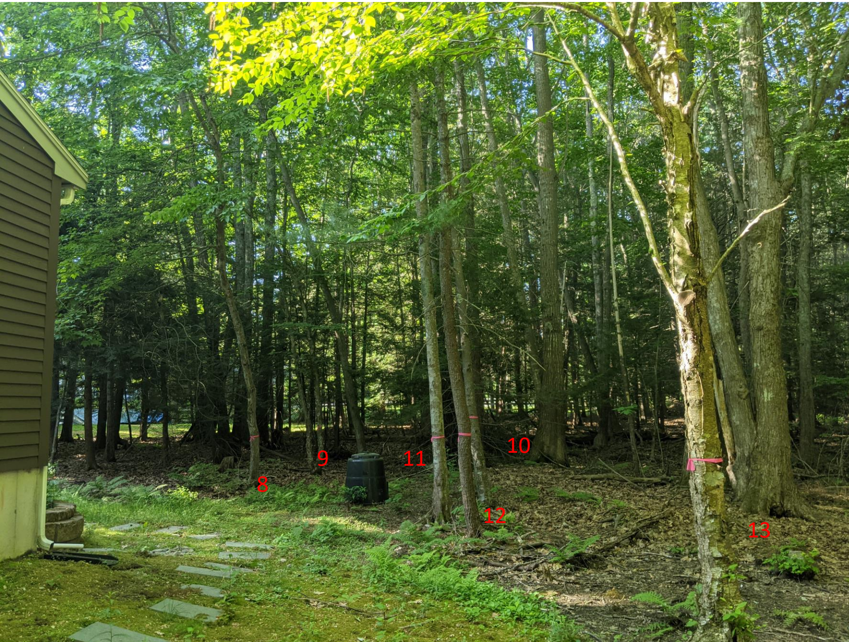
Overview trees 8-13 and their position relative to the back of the house.