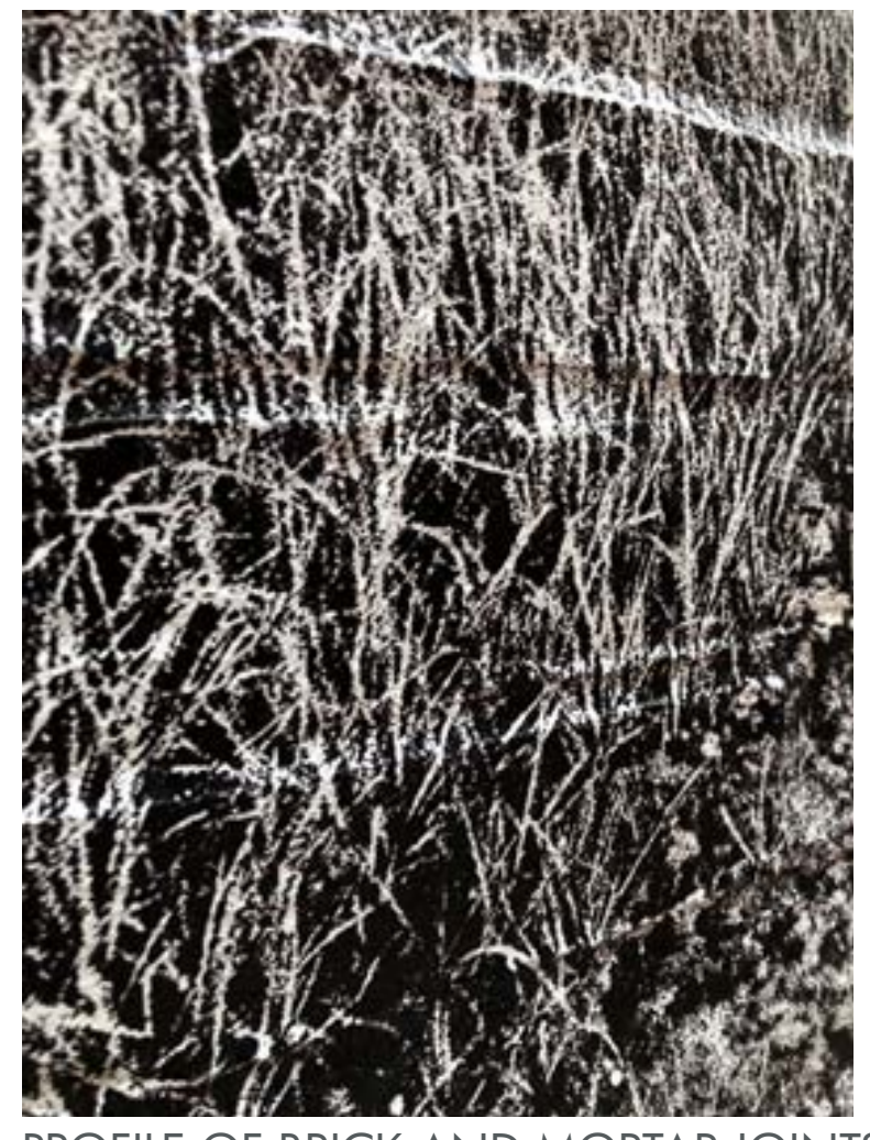
PROFILE OF BRICK AND MORTAR JOINTS VIEWED THROUGHT VINYL MATERIAL