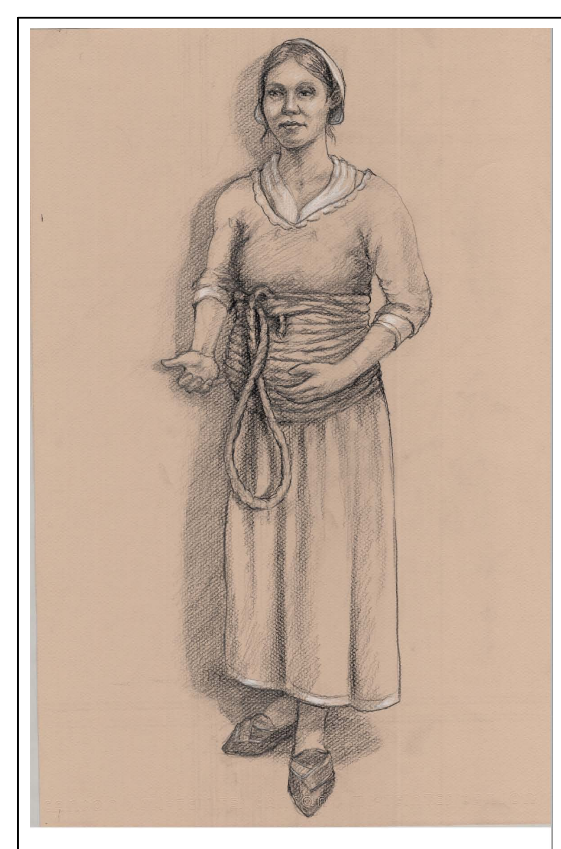
Sketch for Ruth Blay Mural