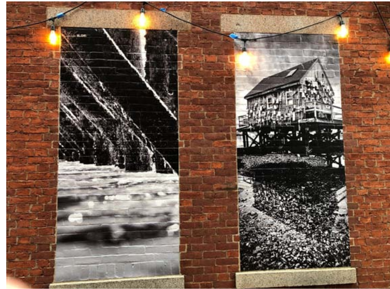
MURALS ON COMMERCIAL ALLEY WITH SIMILAR MATERIAL

The entirety of the mural itself (rendering, title, text, etc.) will be printed on an adhesive vinyl material similar to a few comparable murals in the downtown area.