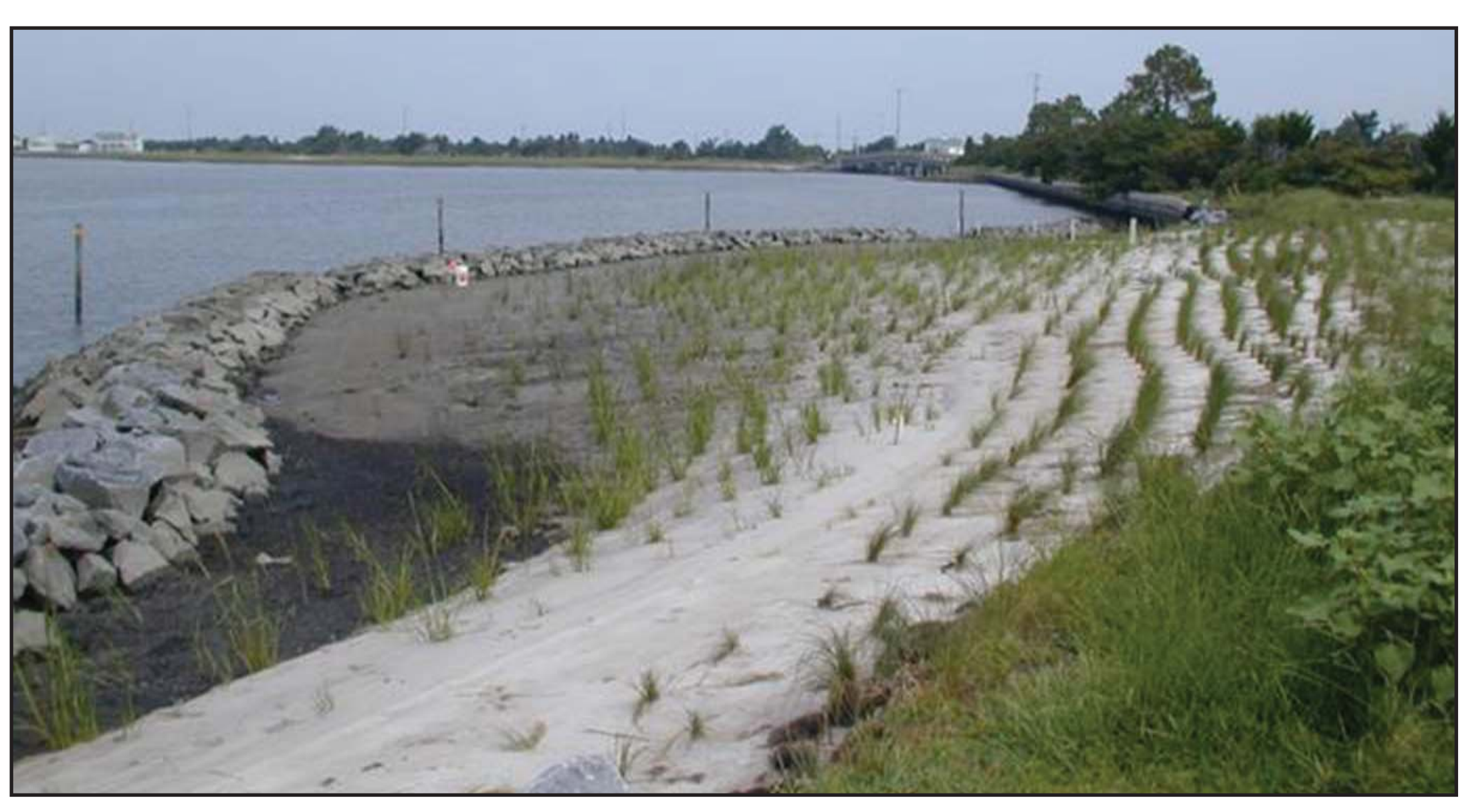
BOULDERS AS SILL STRUCTURE | PROPOSAL WILL BE TO USE WIRE GABIONS FILLED WITH OYSTER SHELL