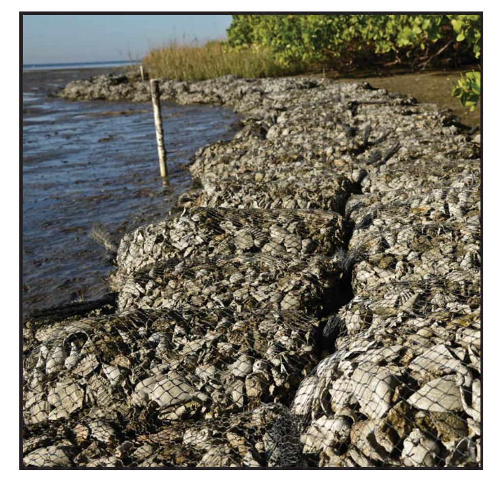
GABIONS WITH OYSTER SHELL (CULTCH)