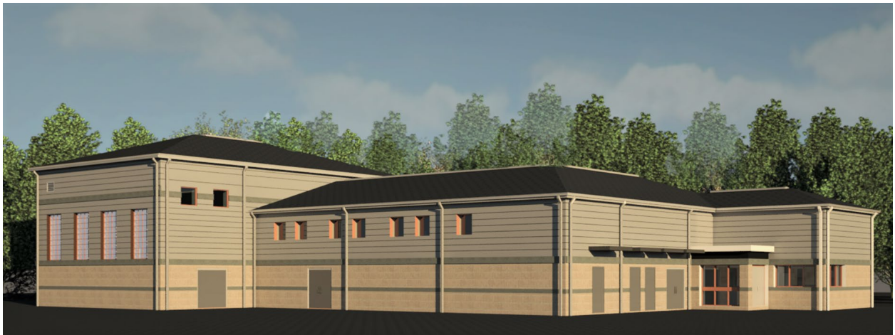
Rendering of Proposed Drinking Water Treatment Facility Upgrade – Grafton Road

The City of Portsmouth and the United States Air Force have recently signed their latest agreement to treat perfluorooctanesulfonic acid (PFOS) and perfluorooctanoic acid (PFOA) from water supplied by the Smith, Harrison and Haven Wells serving the Pease Tradeport drinking water system. The agreement will provide the City with up to $14.3 million to reimburse the cost of construction of the final treatment system for all three wells, which will include a dual filtration system consisting of resin and granular activated carbon filters. We anticipate bidding the project this fall with construction beginning in the spring of 2019.