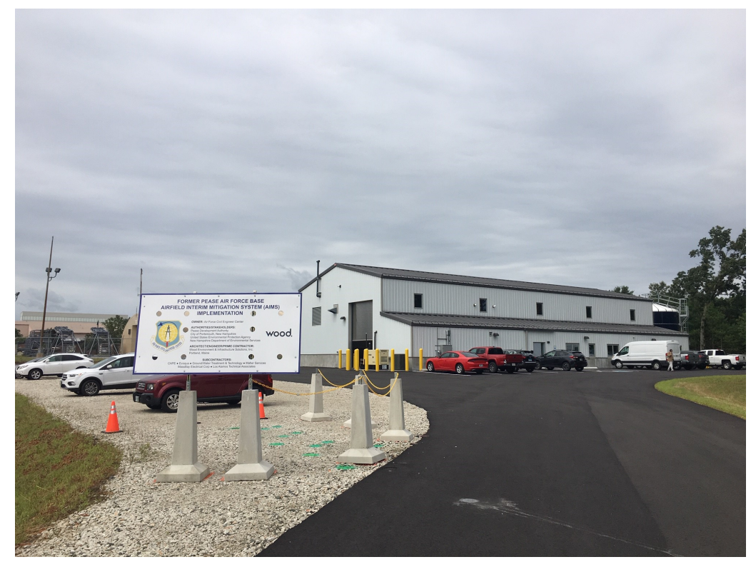
AIMS TREATMENT SYSTEM FACILITY