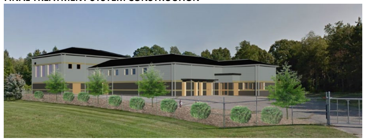
Rendering of Proposed Drinking Water Treatment Facility Upgrade – Grafton Road

Construction of the final treatment system, which will include both resin and activated carbon filters, began in April 2019. Demolition of older structures began at that time and continues.