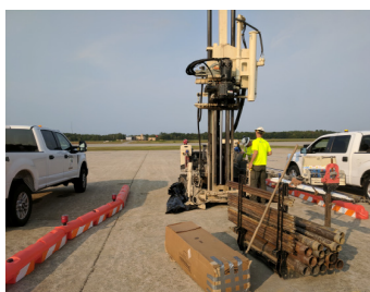
A mobile drilling rig will be used to install monitoring wells.

monitoring wells: You may see members of our team at a number of locations working with a drill rig, installing monitoring wells. Collection of approximately 80 groundwater samples are planned.