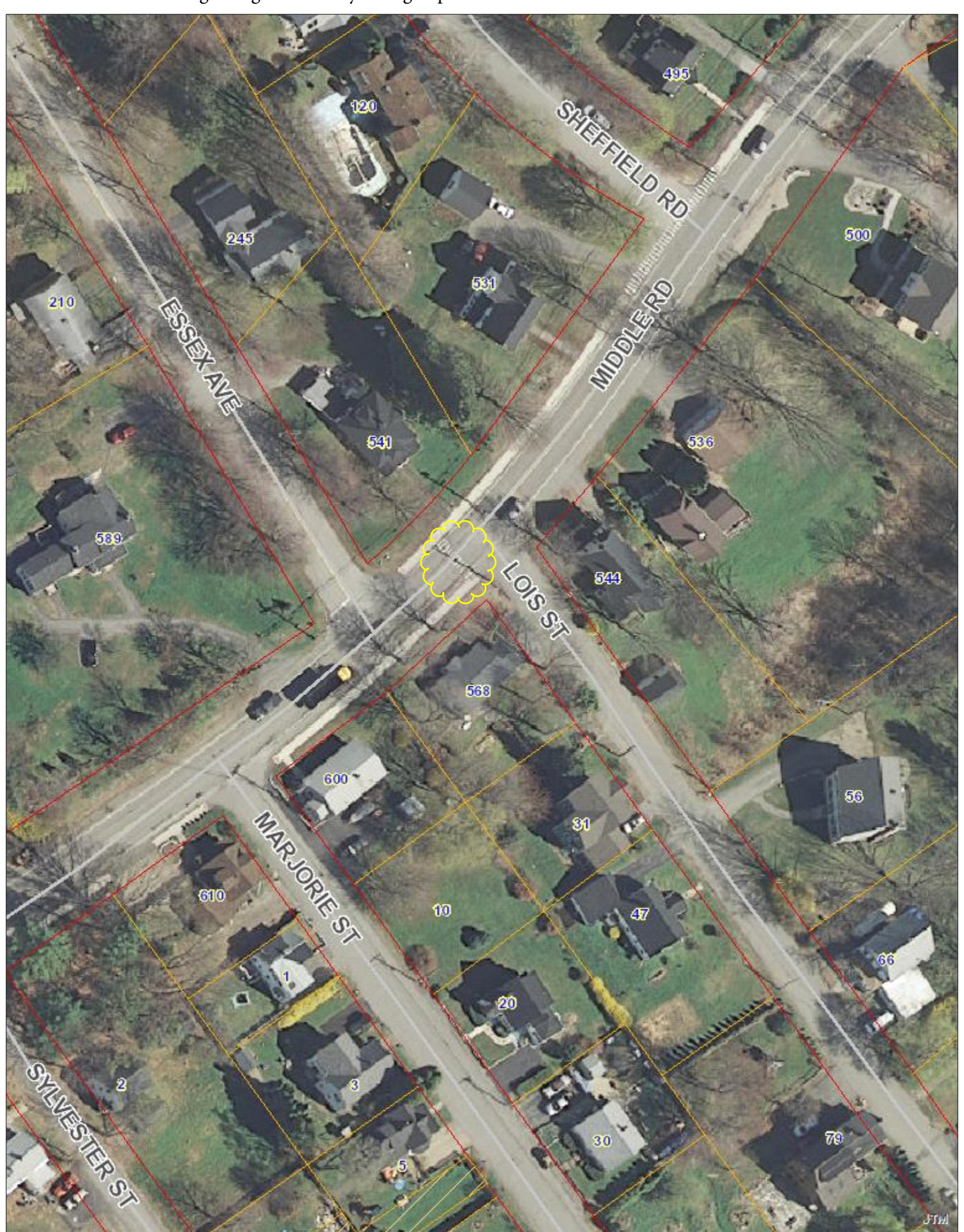
VI.A. Concerns regarding traffic not yielding to pedestrians in crosswalk on Middle Road at Essex Avenue